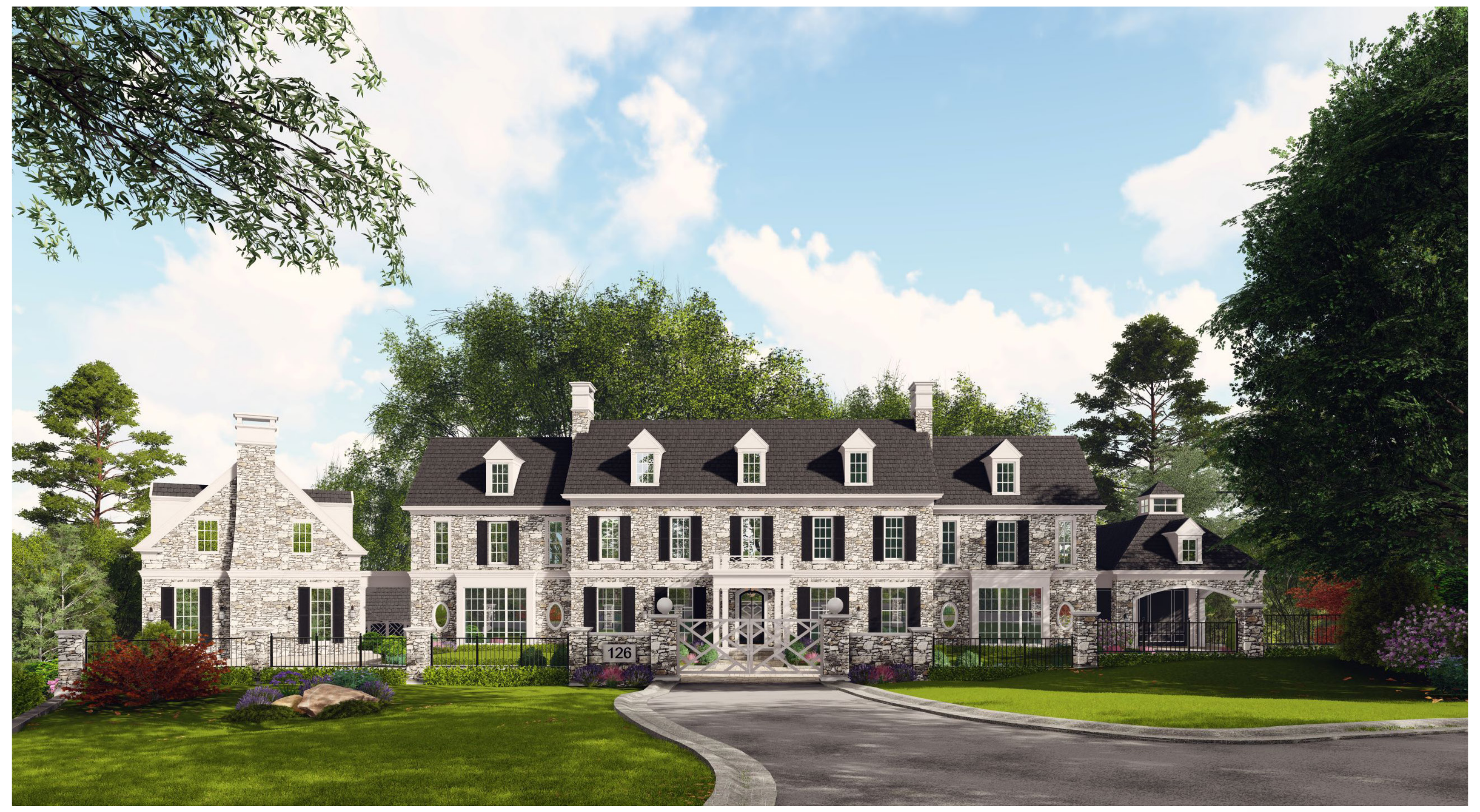
126 Klein's Ridge Front Perspective