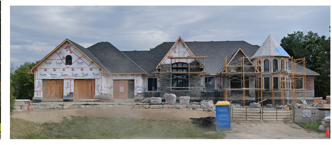
110 Klein's Ridge 125 Klein's Ridge 125 Klein's Ridge