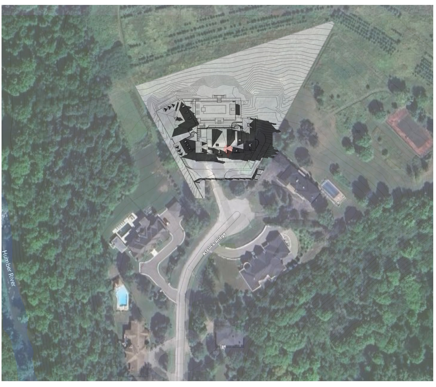
126 Klein's Ridge Proposed: Apr 2024; 5 pm