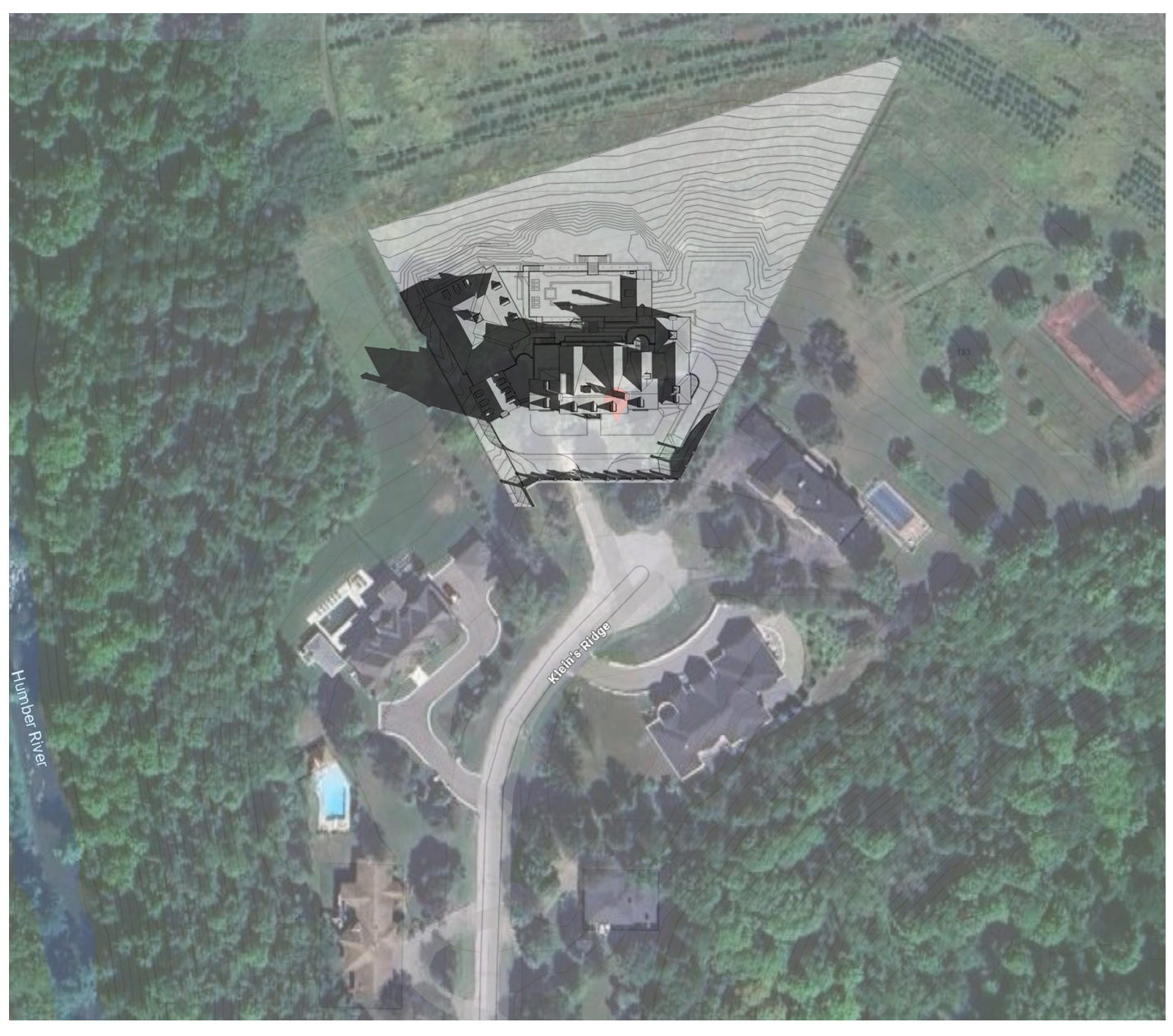
126 Klein's Ridge Proposed: Apr 2024; 7 am