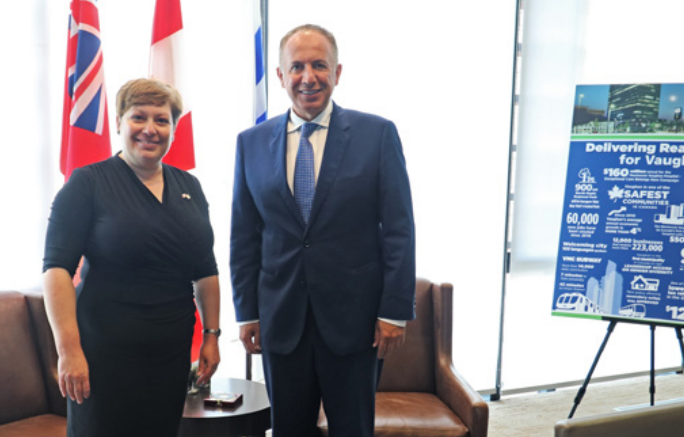
Mayor Bevilacqua meets with Consul General Baram at Vaughan City Hall April 2019

"Israel and Canada share a strong relationship based on shared values, growing economic ties at the federal, provincial and municipal levels. Our friendship with the City of Vaughan can be credited to a growing Israeli and Jewish community that maintains strong business and cultural ties to the State of Israel, while contributing to the city's growth and success.