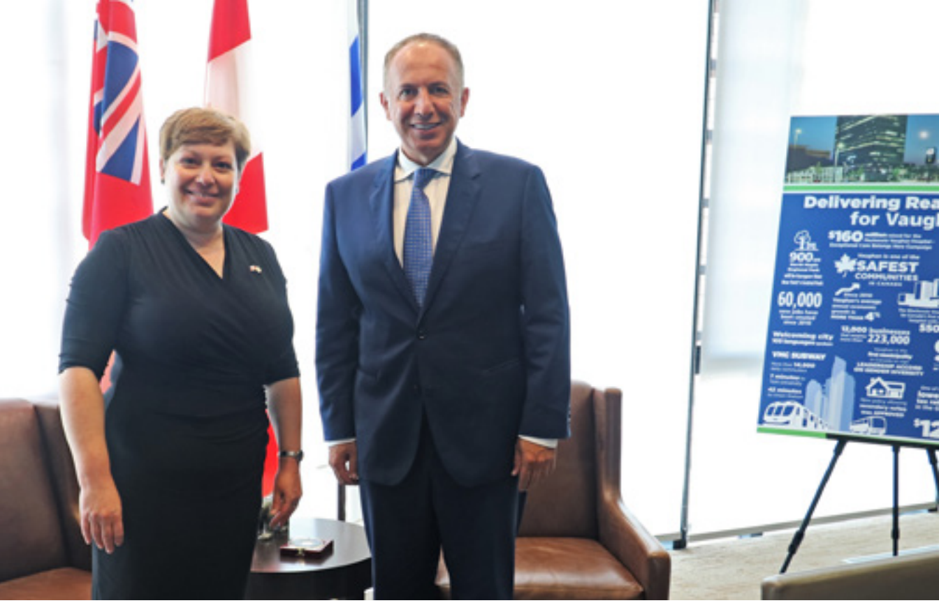
Mayor Bevilacqua meets with Consul General Baram at Vaughan City Hall April 2019

"Israel and Canada share a strong relationship based on shared values, growing economic ties at the federal, provincial and municipal levels. Our friendship with the City Vaughan can be credited to a growing Israeli and Jewish community that maintains strong business and cultural ties to the State of Israel, while contributing to the city's growth and success.