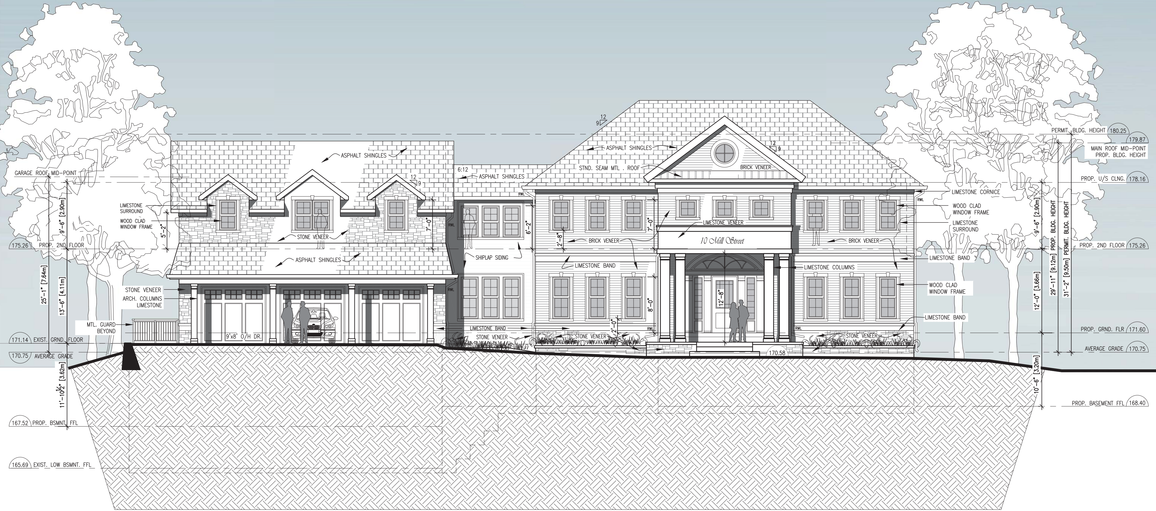
PROPOSED SOUTH (FRONT) ELEVATION