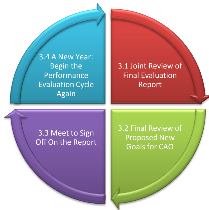
Figure 4: Annual CAMA Performance Evaluation Cycle, Part 3

3.1: Joint Review of the Final Performance Evaluation Report – The conversation presents and discusses the Final Performance Evaluation Report . The templates offer tips about providing constructive feedback. Discussion revolves around the key elements of the Toolkit.