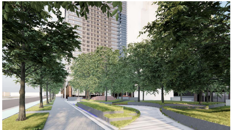
PEDESTRIAN VIEW LOOKING NORTH-WEST FROM THE P.O.P.S