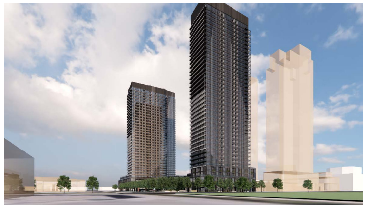
PEDESTRIAN VIEW LOOKING NORTH EAST FROM EDGELEY BLVD