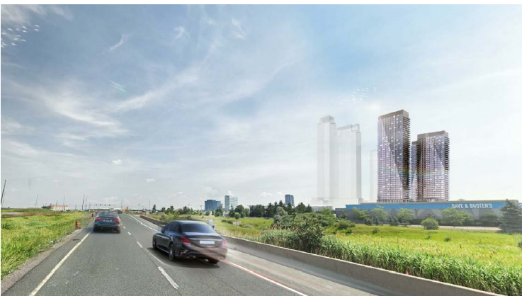
VIEW FROM THE HIGHWAY 400 ON RAMP