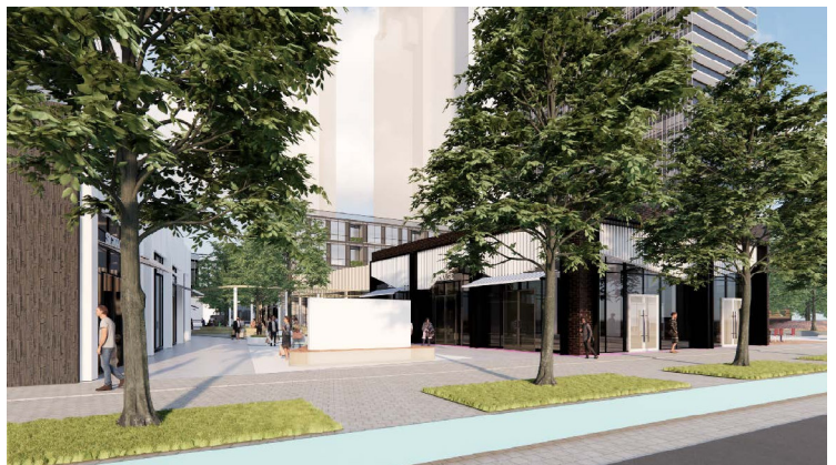
PEDESTRIAN VIEW LOOKING NORTH INTO THE PEDESTRIAN MEWS