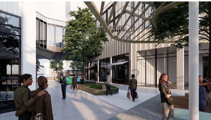
PEDESTRIAN VIEW LOOKING NORTH WITHIN THE PEDESTRIAN MEWS TOWARDS BRIDGE