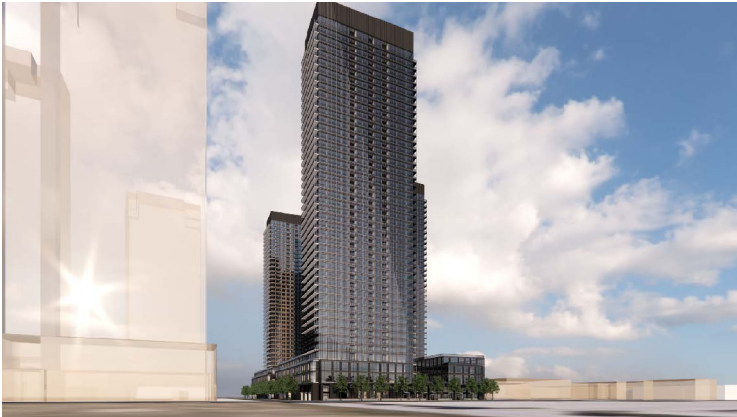
PEDESTRIAN VIEW LOOKING SOUTH EAST FROM COMMERCE ST