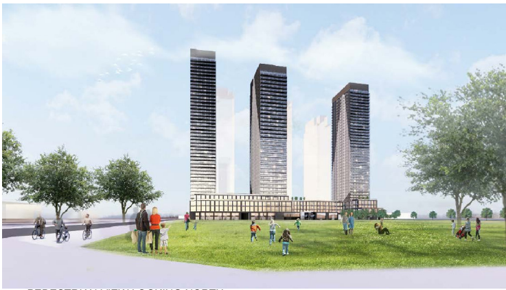
PEDESTRIAN VIEW LOOKING NORTH