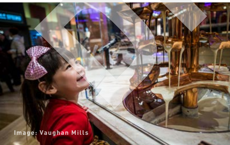
Image: Vaughan Mills

MAKING VAUGHAN AN OVERNIGHT DESTINATION, WITH A VIBRANT DOWNTOWN, IS A LONG-TERM PLANNING GOAL.