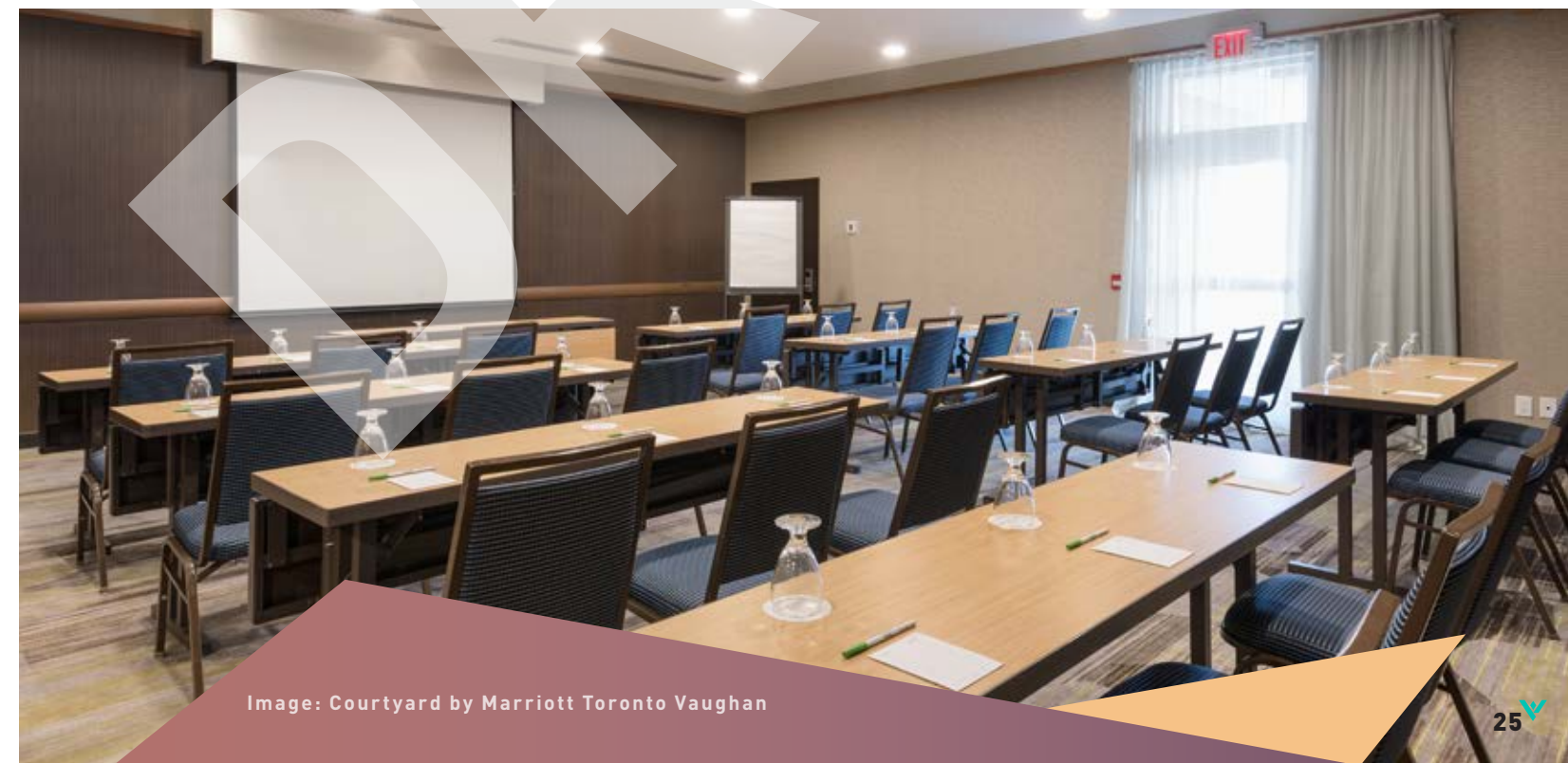
Image: Courtyard by Marriott Toronto Vaughan