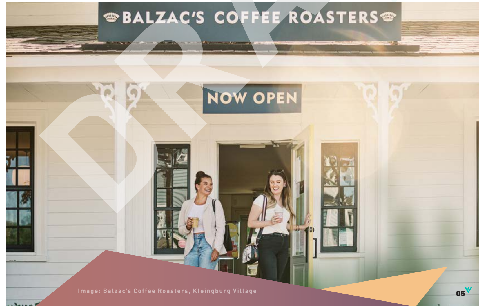
Image: Balzac's Coffee Roasters, Kleingburg Village

The development of the Vaughan Destination Master Plan at this time is an opportunity to rebuild an industry that has been rocked by COVID-19. The City of Vaughan has an obligation to ensure that the MAT revenues are directed to initiatives that will rebuild the tourism industry with a focus on generating overnight visitors.