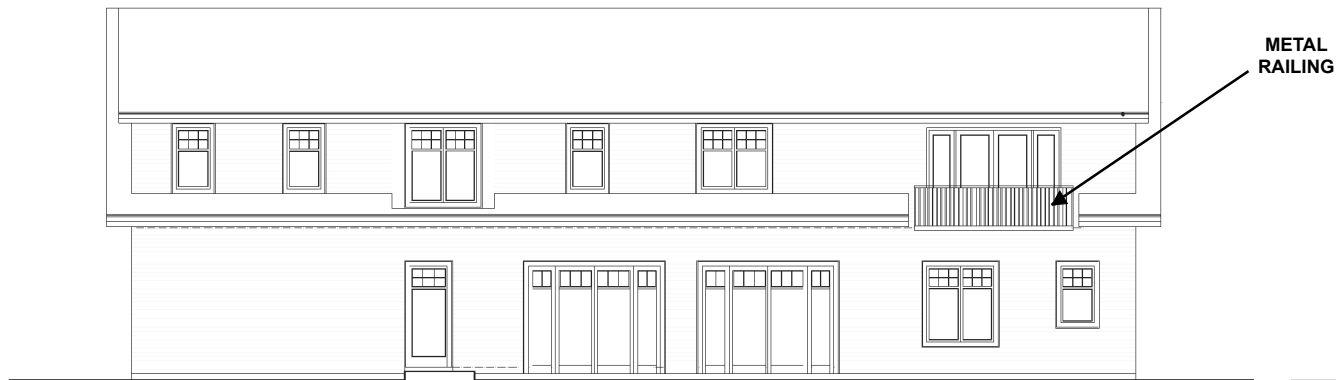
NORTH (REAR) ELEVATION