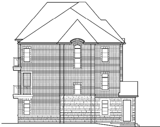
SIDE (WEST) ELEVATION