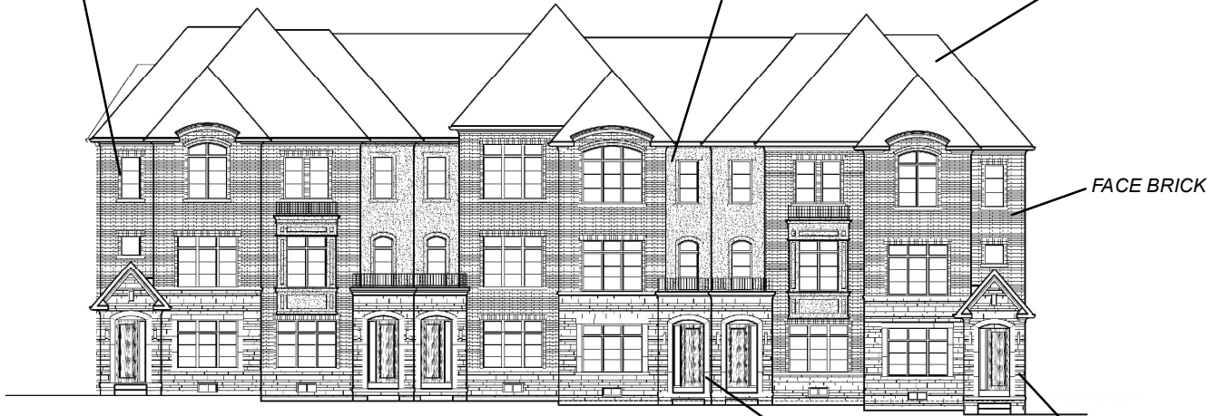
FRONT (NORTH) ELEVATION - FACING MAJOR MACKENZIE DRIVE WEST