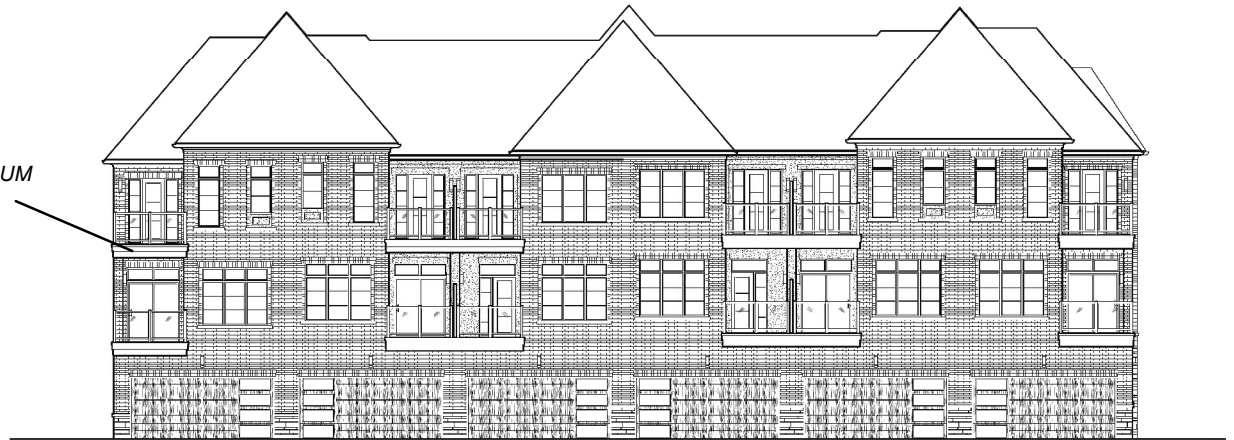
REAR (SOUTH) ELEVATION - FACING INTERNAL ROAD