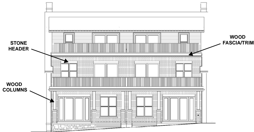
WEST (REAR) ELEVATION