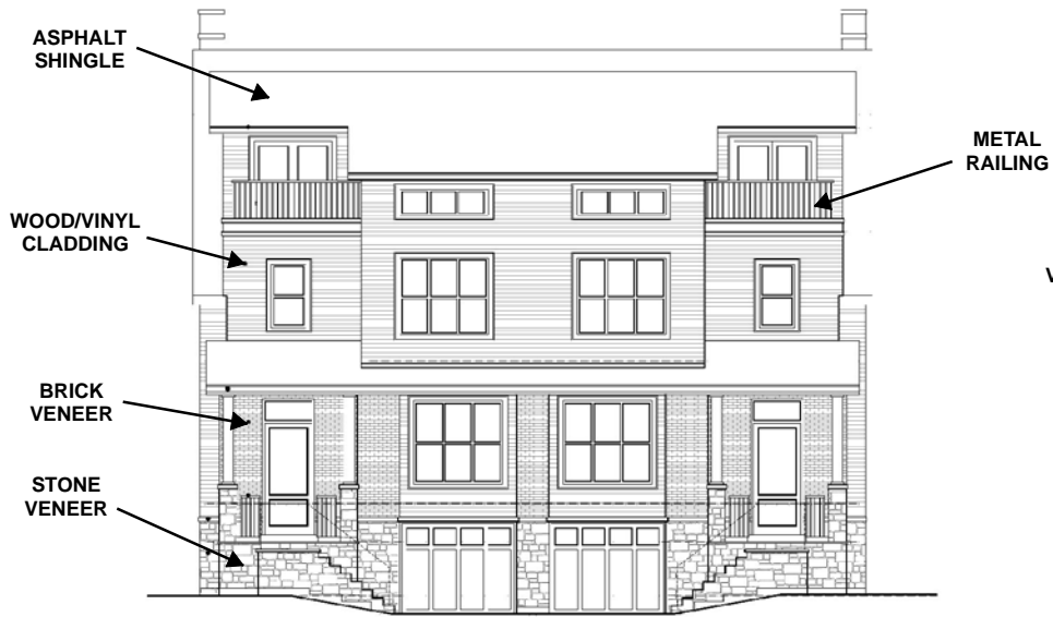
EAST (FRONT) ELEVATION - FACING WALLACE STREET