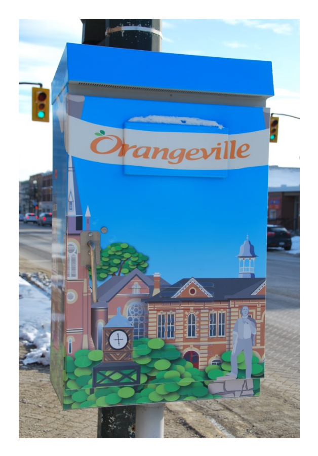
Town of Orangeville