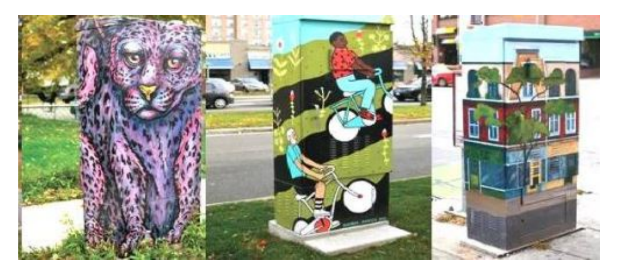
City of Toronto