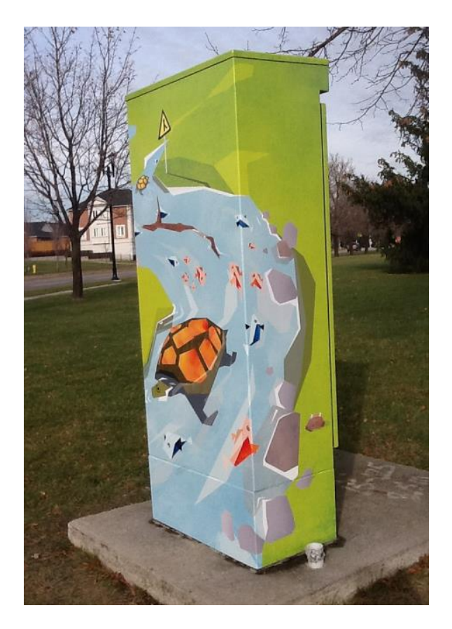
City of Markham