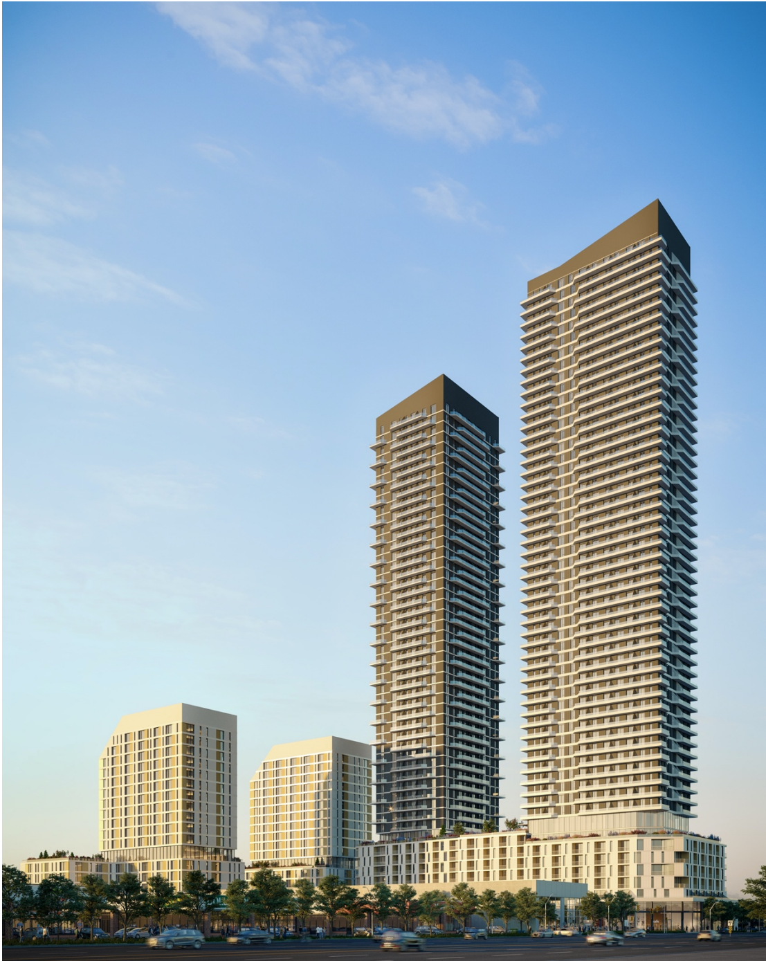
Rendering of Proposal – view looking northeast