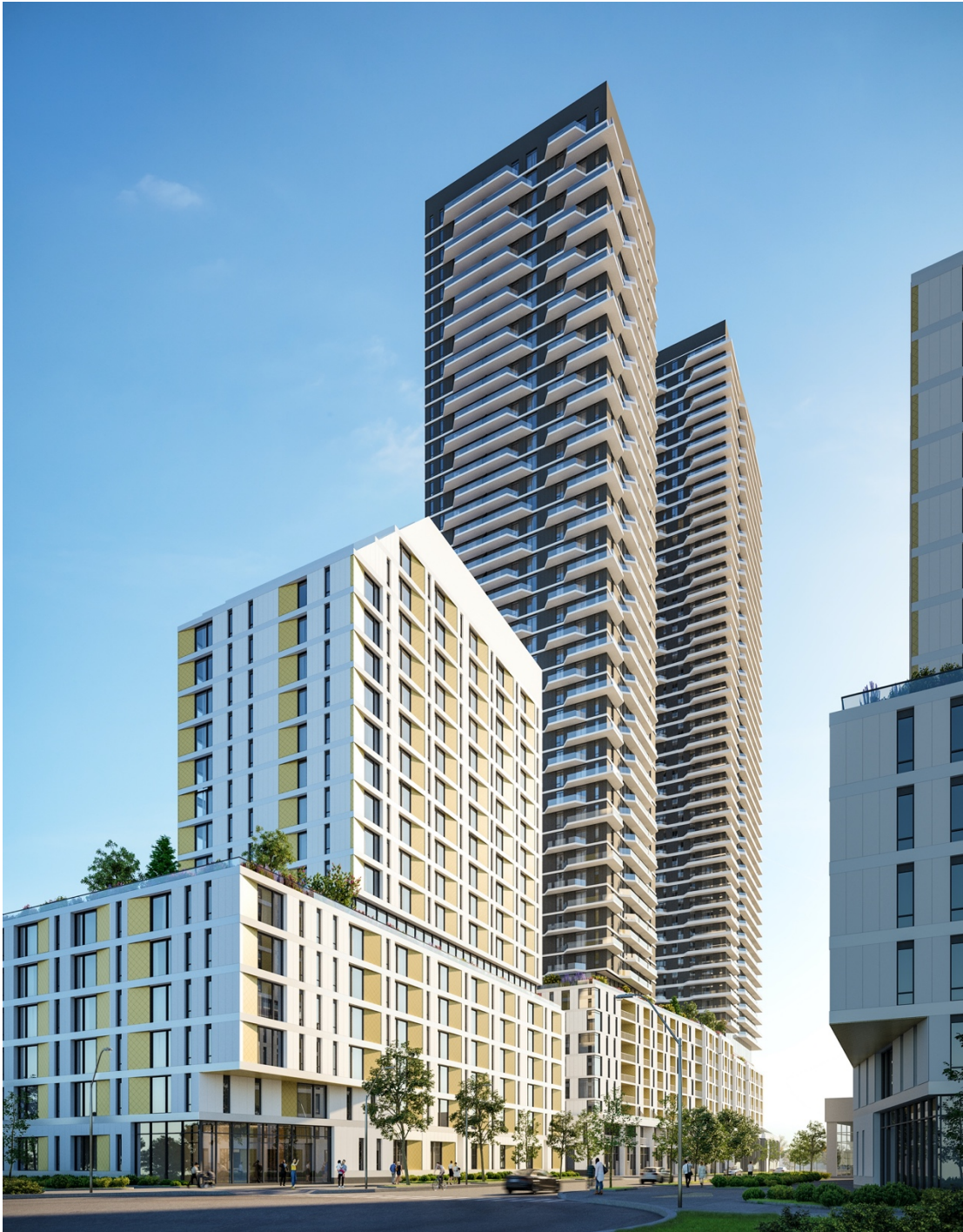
Rendering of proposal – view looking southeast