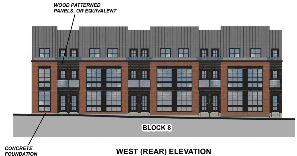
WEST (REAR) ELEVATION