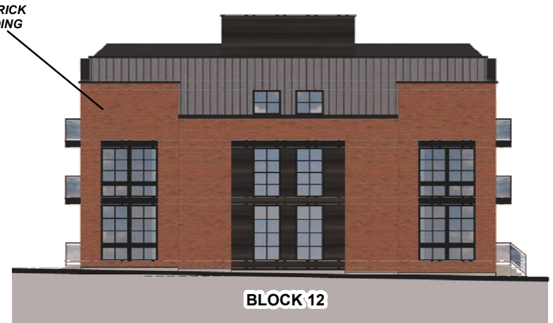
SOUTH ELEVATION - FACING STREET C