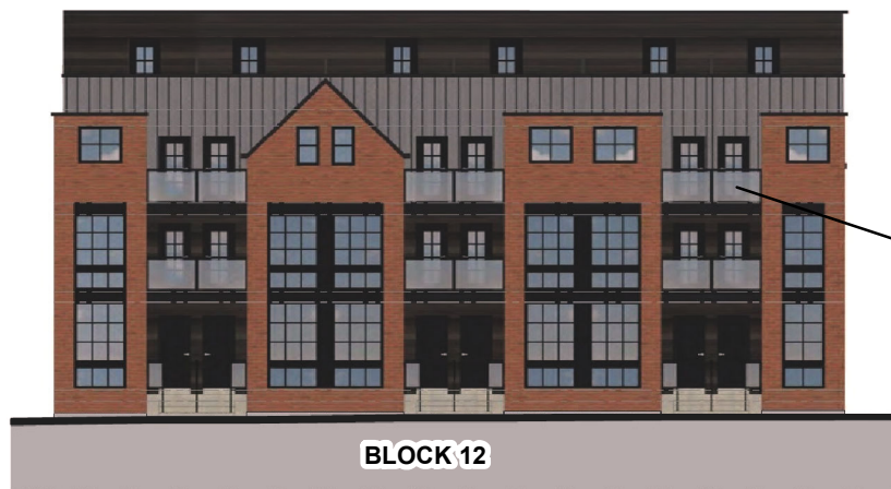
EAST ELEVATION - FACING STREET D