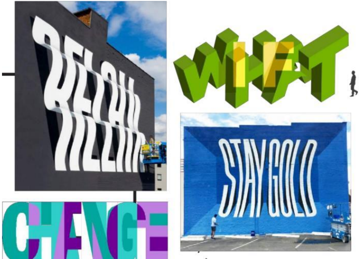
2) Birdo , Toronto – Style: 3D Geometrical & Hyper Realism - North Wall