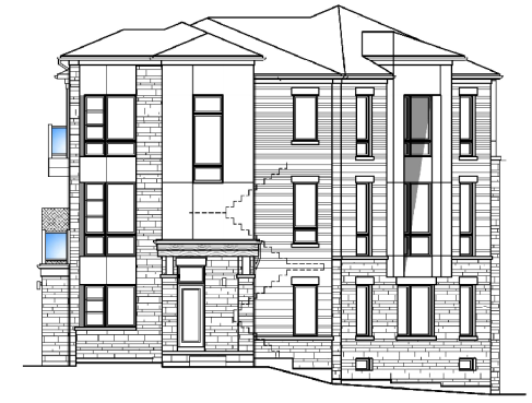
SOUTH (SIDE) ELEVATION FACING WORTH BLVD.