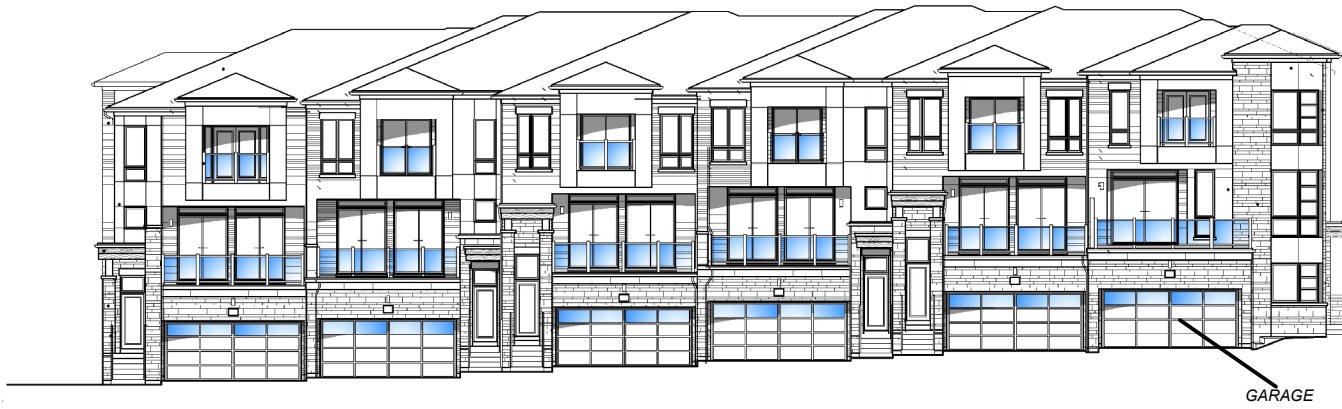
WEST (REAR) ELEVATION - FACING COMMON ELEMENT CONDOMINIUM ROAD