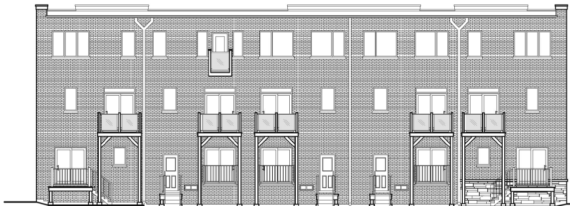
NORTH (REAR) ELEVATION