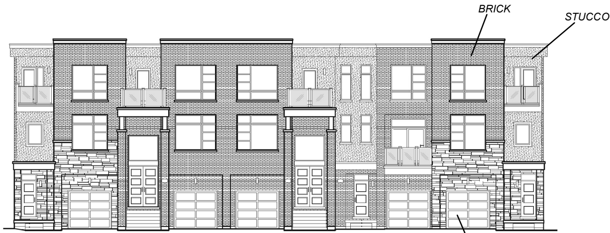
SOUTH (FRONT) ELEVATION - FACING PARADOX STREET