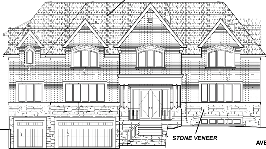
SOUTH ELEVATION - FACING DAVIDSON DRIVE