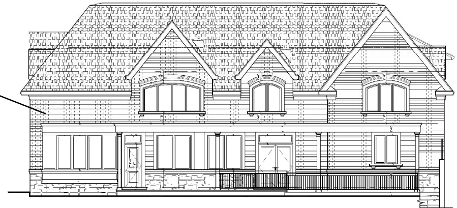
NORTH (REAR) ELEVATION