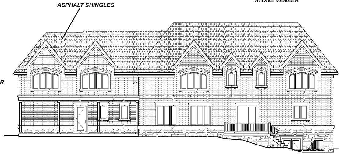
WEST (REAR) ELEVATION