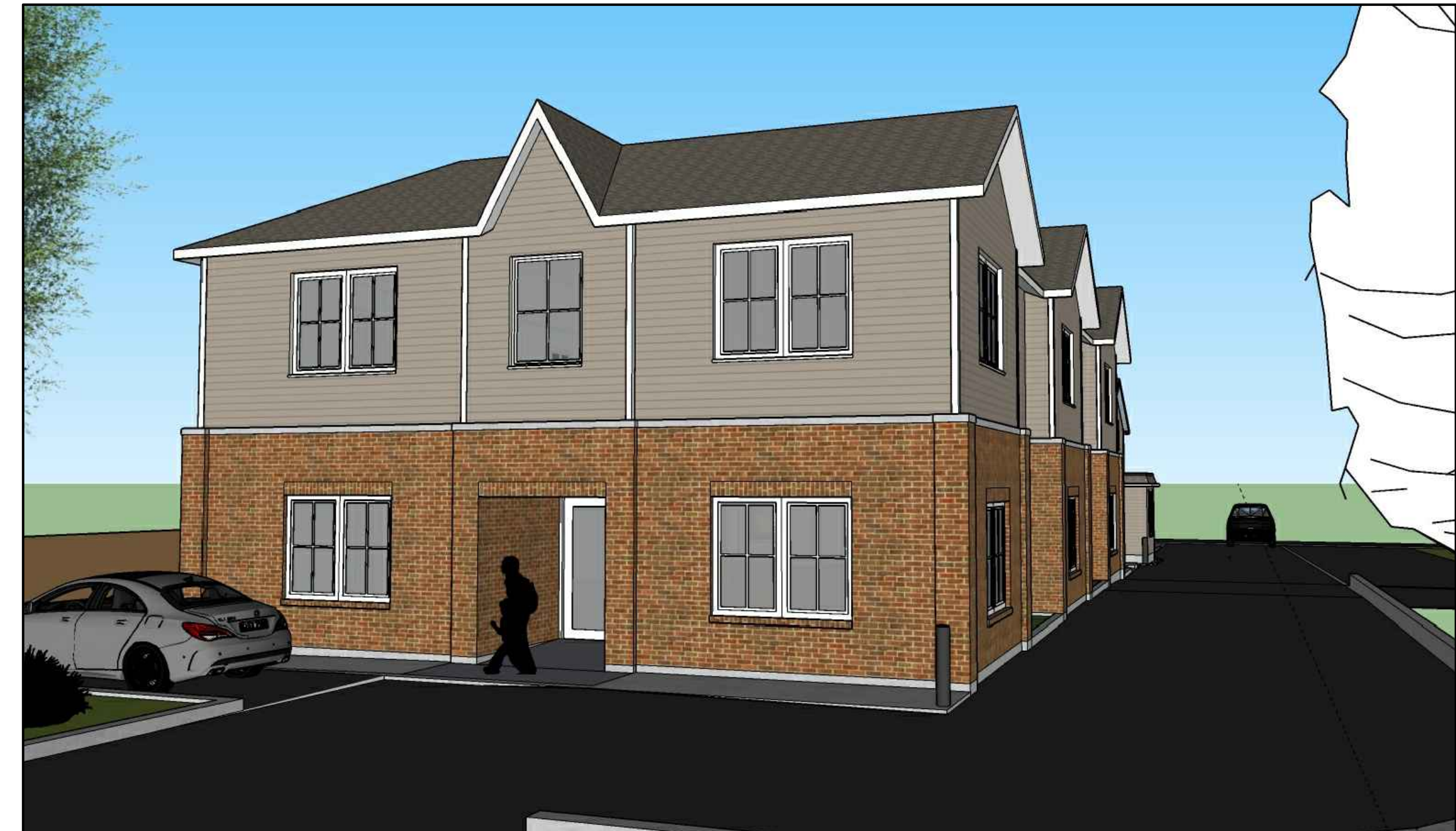
VIEW FROM REAR PARKING LOT