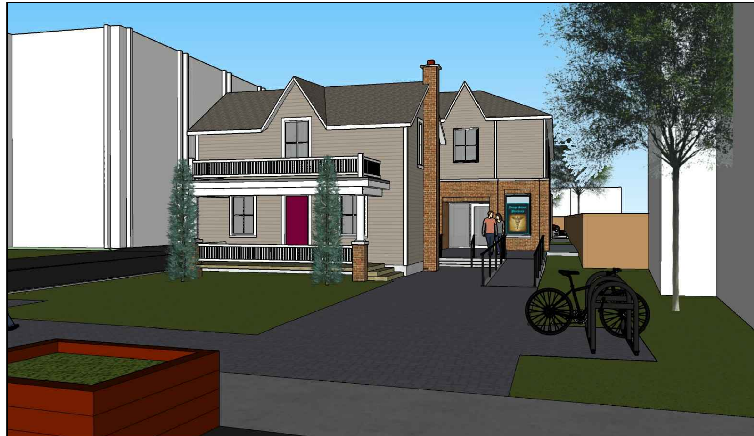
VIEW FROM YONGE STREET NORTH