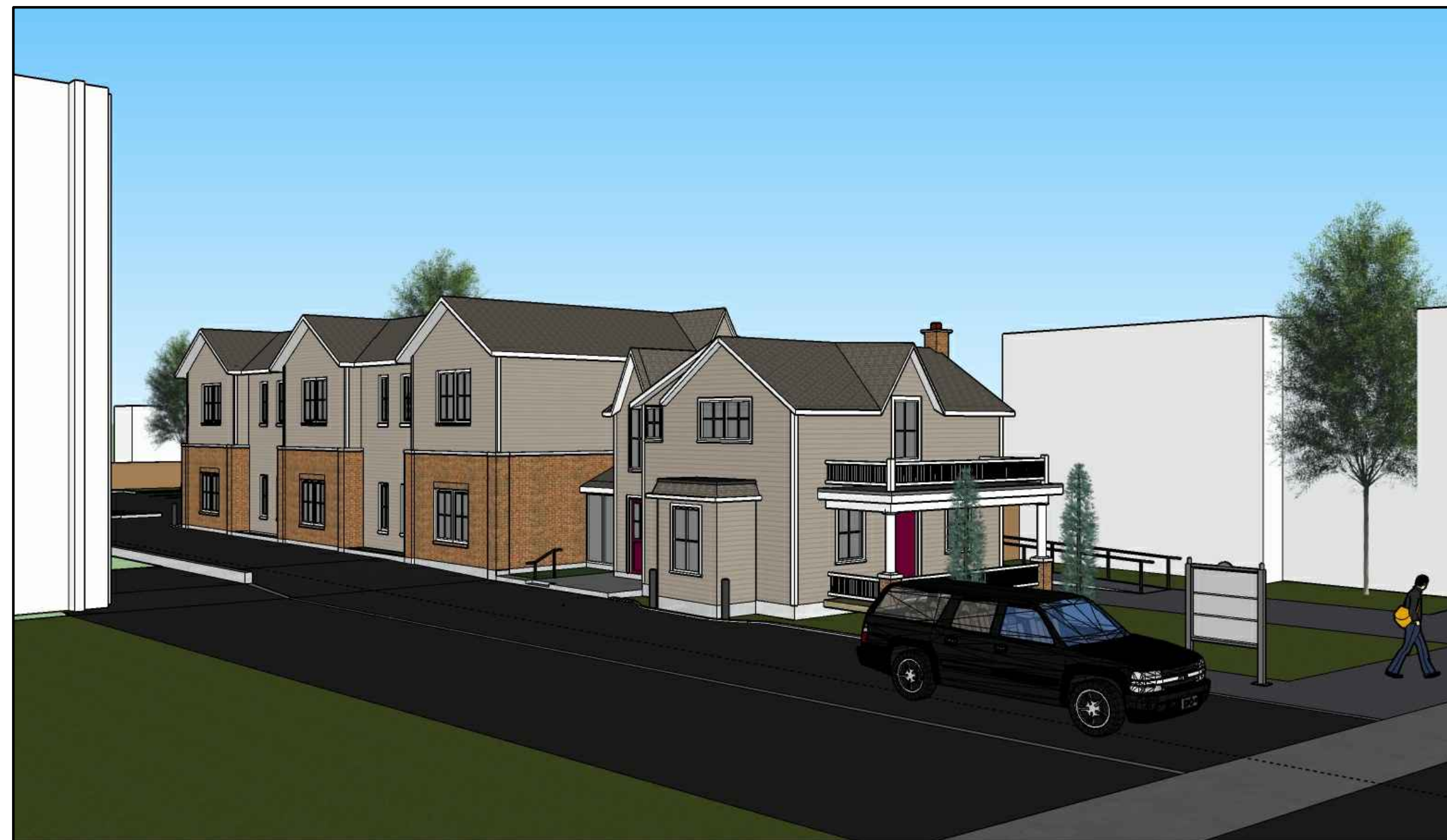
VIEW FROM YONGE STREET SOUTH