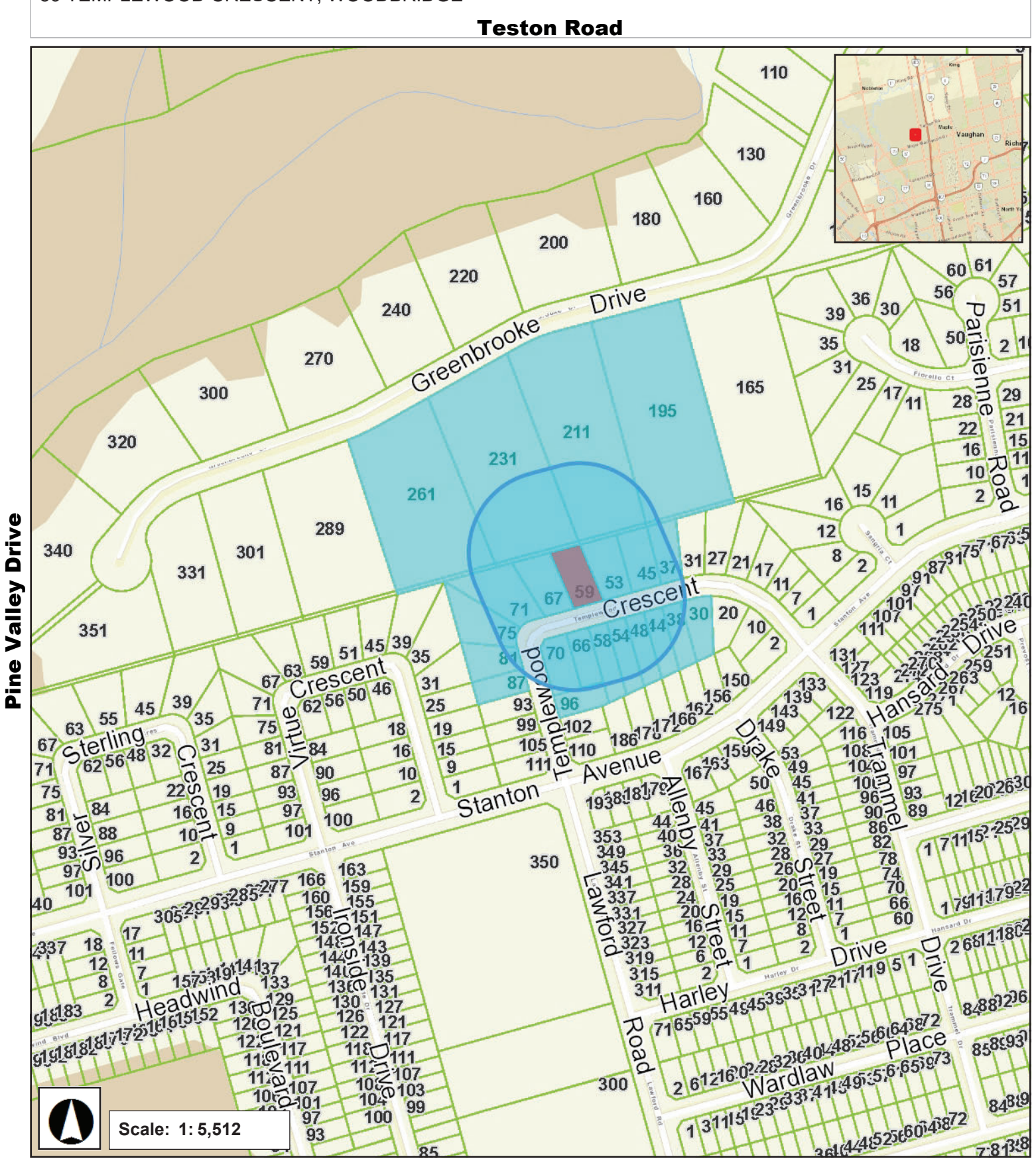
Major Mackenzie Drive