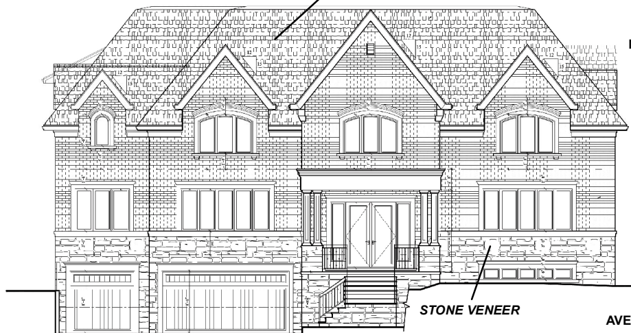
SOUTH ELEVATION - FACING DAVIDSON DRIVE