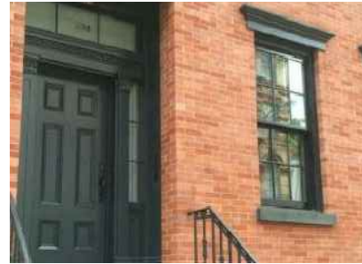
1. RED BRICK