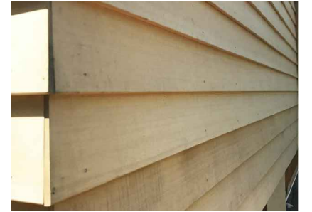
2. 150mm WIDE YELLOW WOOD SIDING