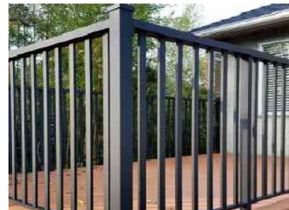
7. PRE-FINISHED ALUMINUM PICKET RAILING/GUARD