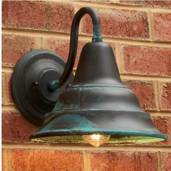
9. EXTERIOR WALL LIGHT