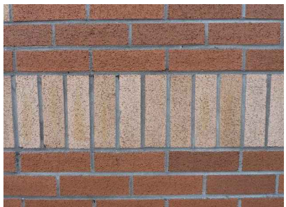
5. YELLOW BRICK SOLDIER COURSE AND HEADER