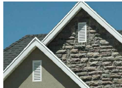
8. WOOD LOUVER VENT