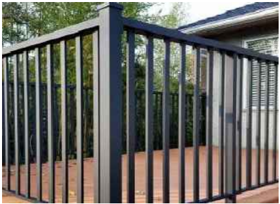
7. PRE-FINISHED ALUMINUM PICKET RAILING/GUARD