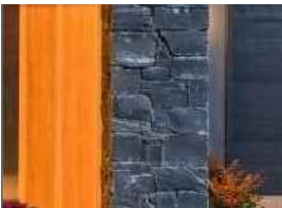
6. DARK GREY STONE MASONRY