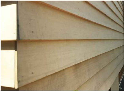
2. 150mm WIDE YELLOW WOOD SIDING