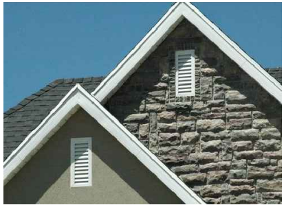
8. WOOD LOUVER VENT