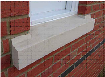
4. STONE WINDOW SILL