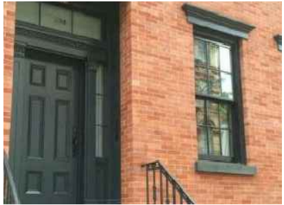
1. RED BRICK

NOTE: ALL PROPOSED WALL MOUNTED LIGHTS SHOWN ON ELEVATION SHALL BE DIRECTED DOWNWARD