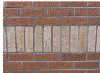
5. YELLOW BRICK SOLDIER COURSE AND HEADER