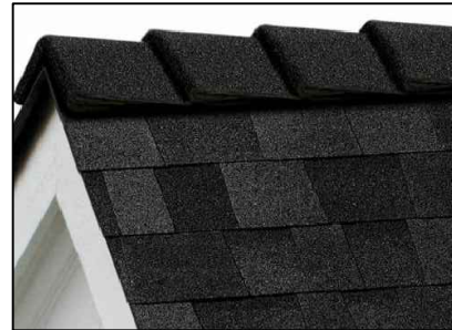
3. BLACK ROOF SHINGLES