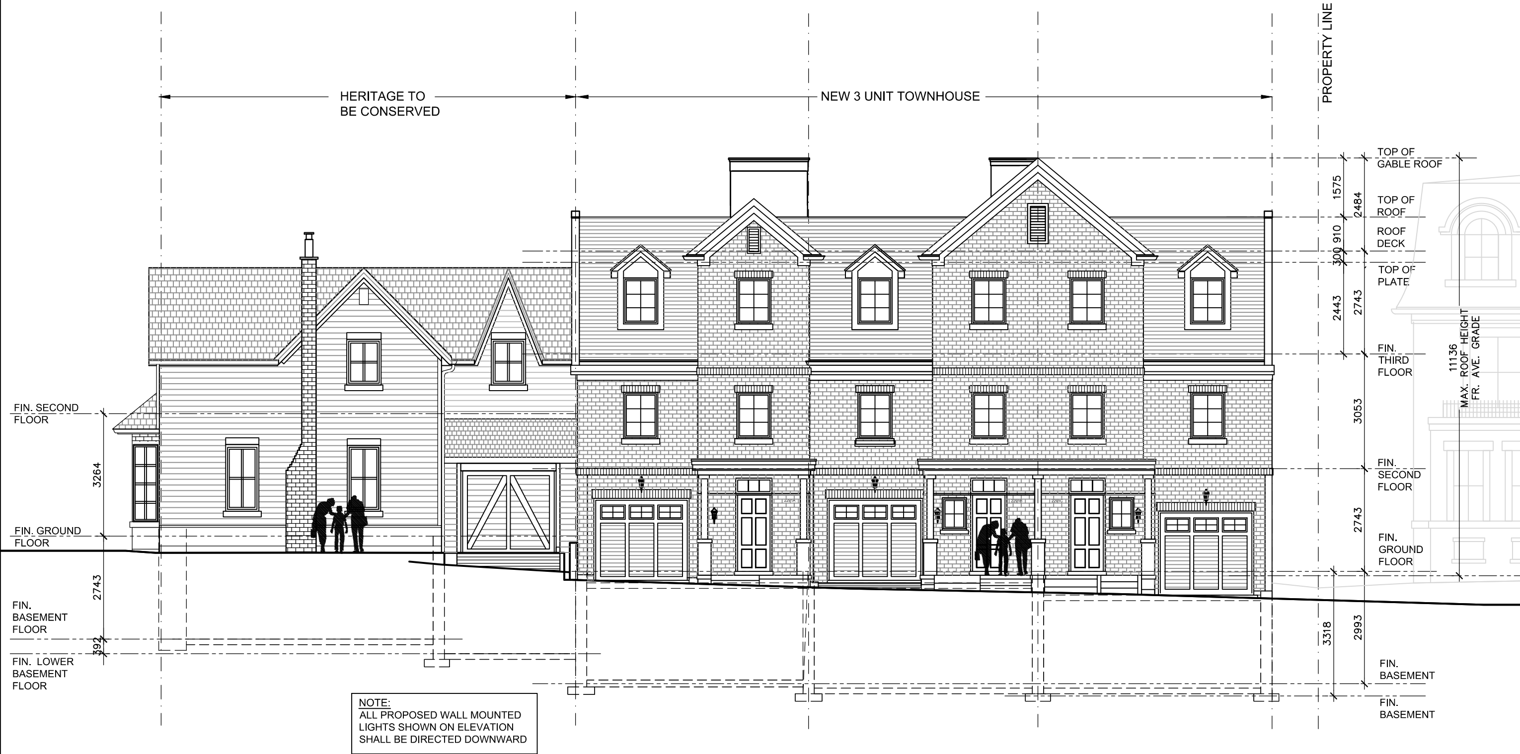
PROPOSED WEST ELEVATION SCALE: 1:100