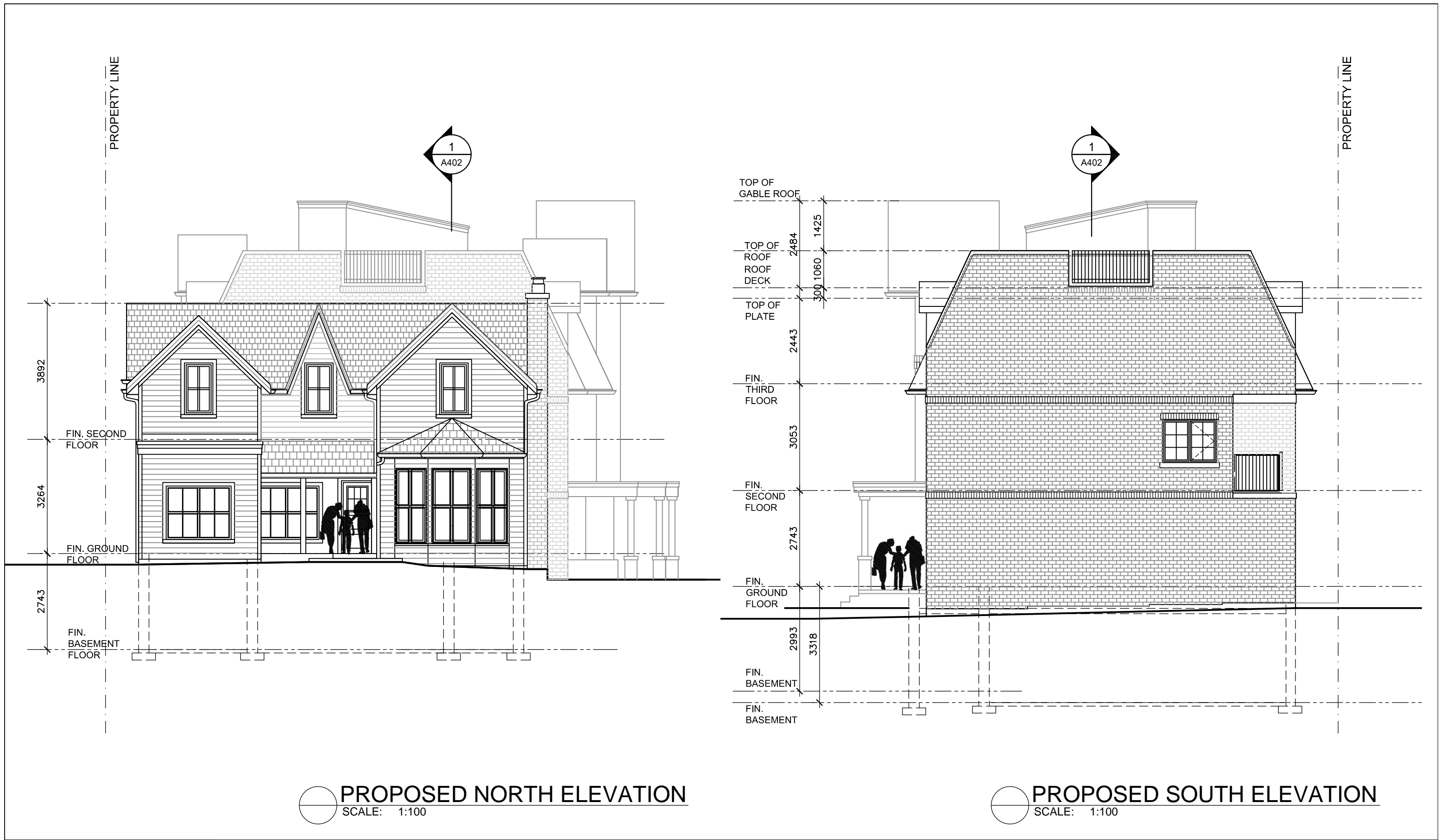
PROPOSED NORTH ELEVATION SCALE: 1:100