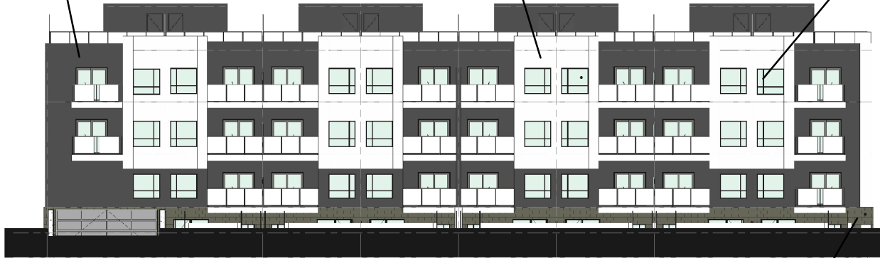
WEST ELEVATION - FACING INTERIOR ROAD