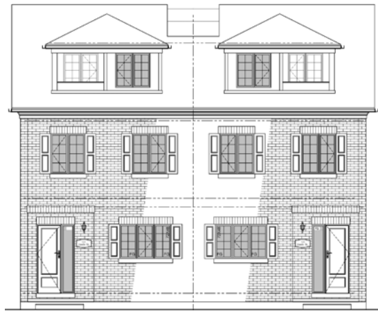
REAR ELEVATION - SEMI 1 AND SEMI 5