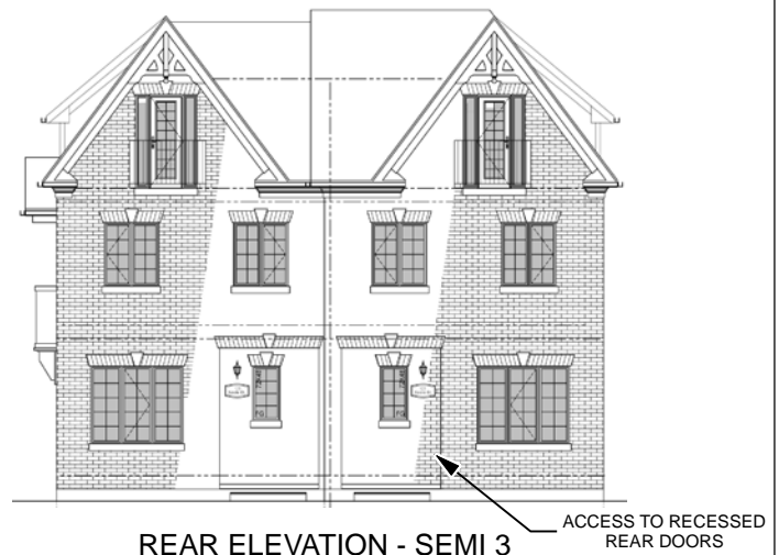
REAR ELEVATION - SEMI 3