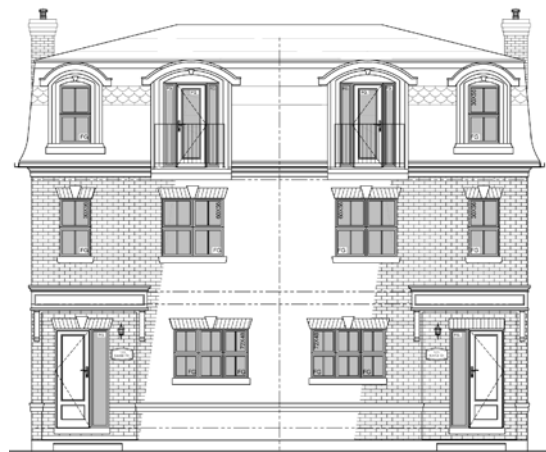
REAR ELEVATION - SEMI 2 AND SEMI 4