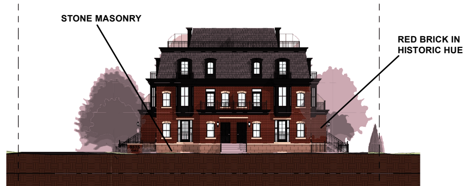
WEST ELEVATION - FACING KEELE STREET