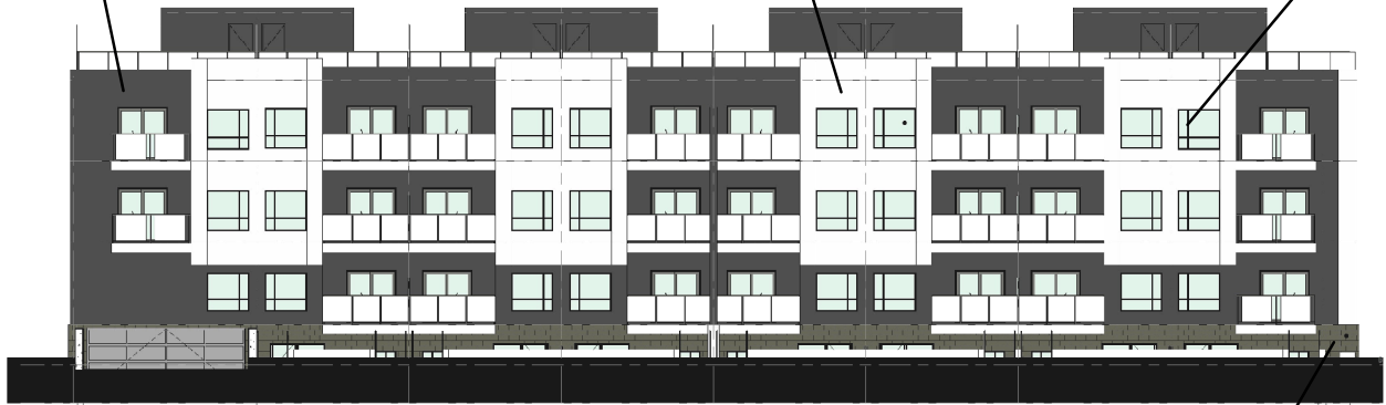
WEST ELEVATION - FACING INTERIOR ROAD