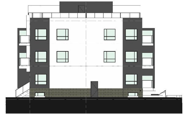
SOUTH ELEVATION - FACING INTERIOR ROAD