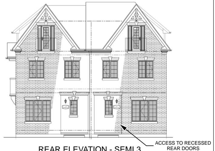
REAR ELEVATION - SEMI 3