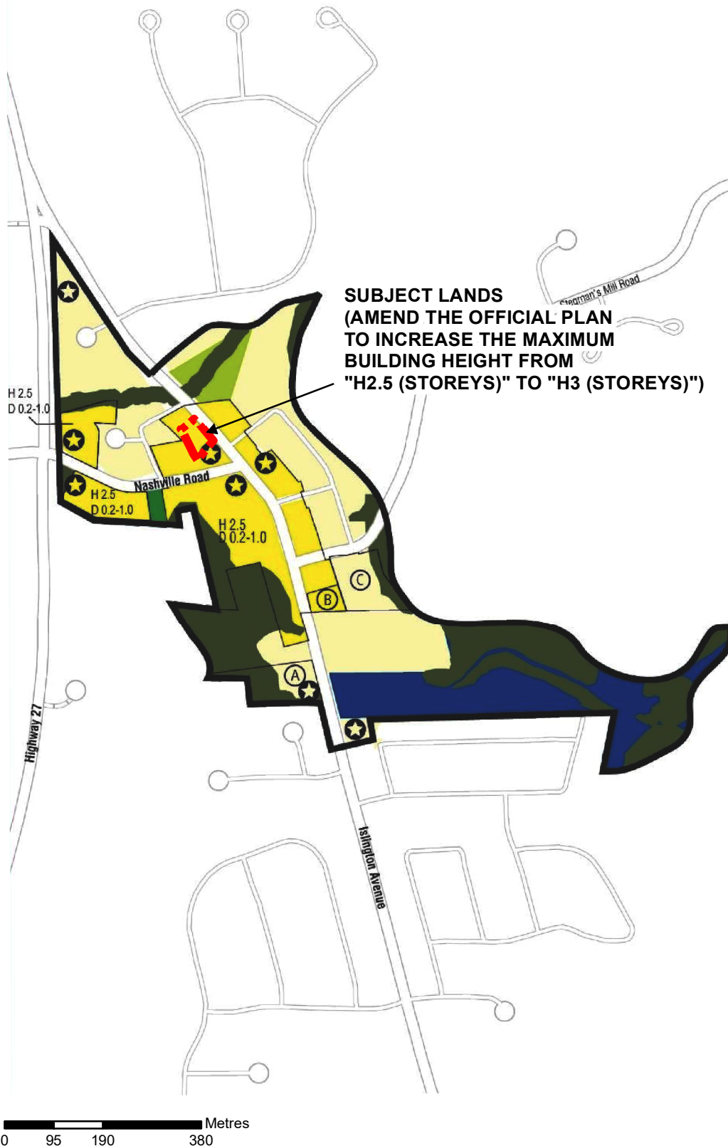
Map 12.4.A: Kleinburg Core Land Uses