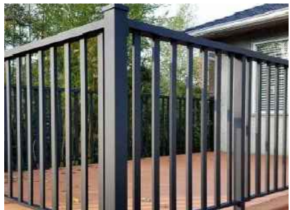
7. PRE-FINISHED ALUMINUM PICKET RAILING/GUARD