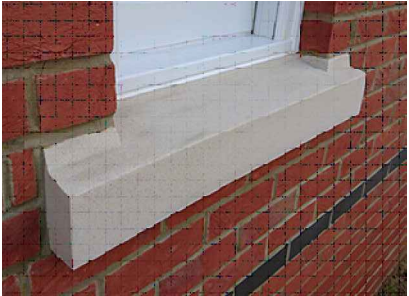
4. STONE WINDOW SILL