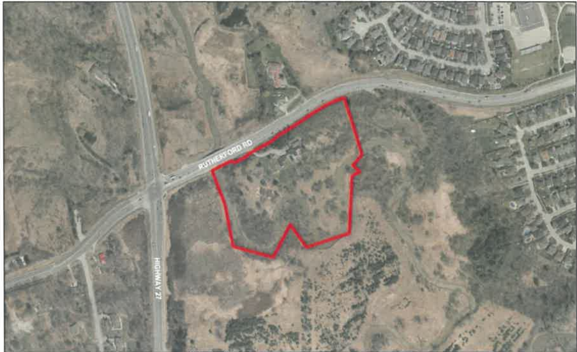
Figure 1- Air Photo of Subject Property