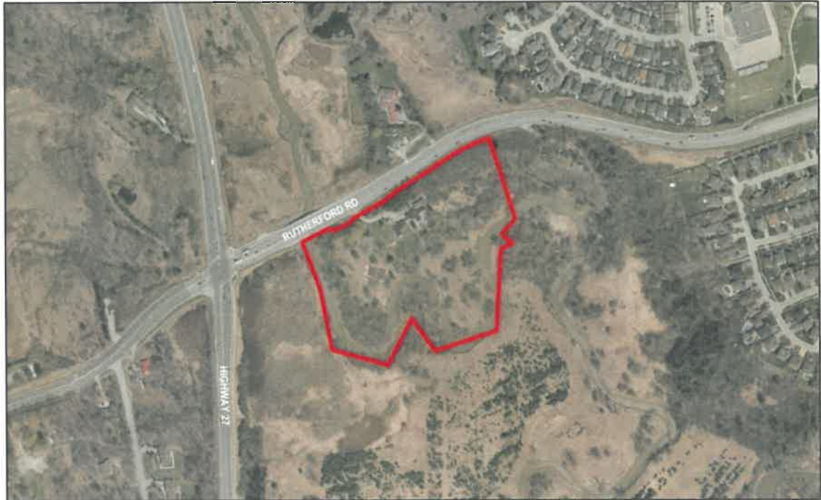
Figure 1- Air Photo of Subject Property