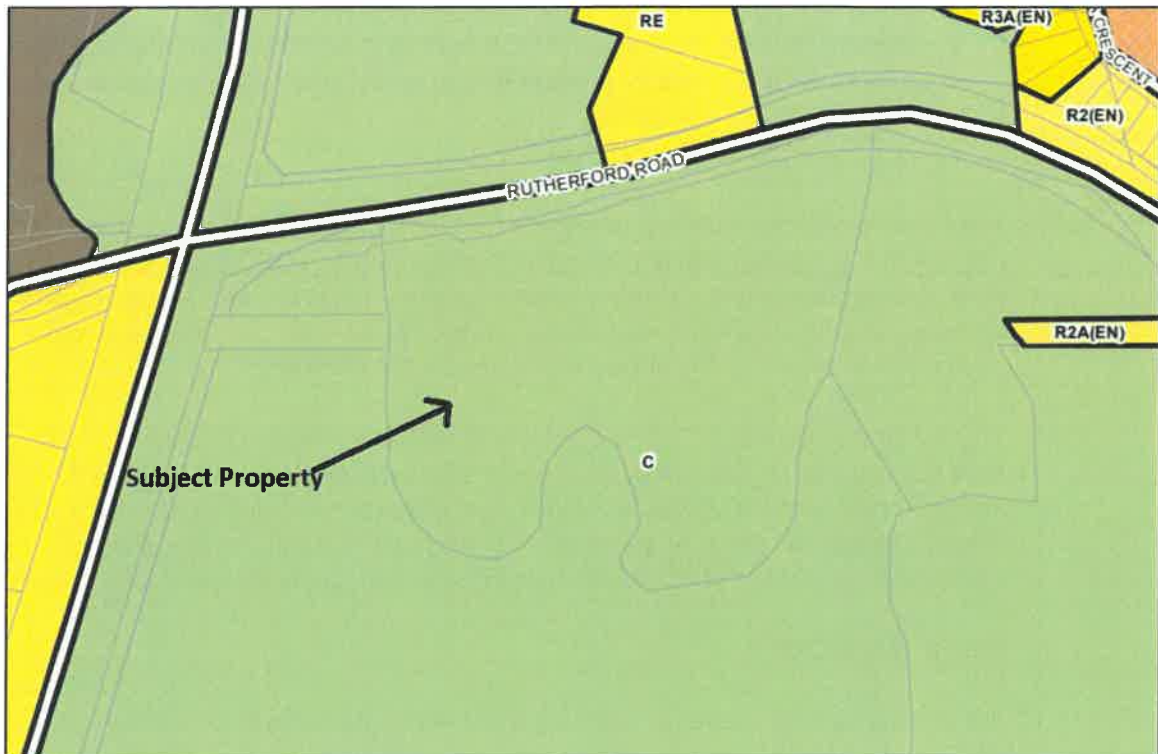
Figure 2- Proposed Comprehensive Zoning Review Mapping

Within the proposed first draft mapping of the comprehensive review, the subject property is zoned Conservation Zone (C) which only permits conservation uses and passive recreational uses. It is our opinion that that the proposed zoning category should be revised to reflect the existing uses which is residential in nature. It is our opinion that the subject property should be zoned First Residential Zone (R1) or similar residential zone. The purpose of this zoning is to recognize the existing uses, which is a single family dwelling.