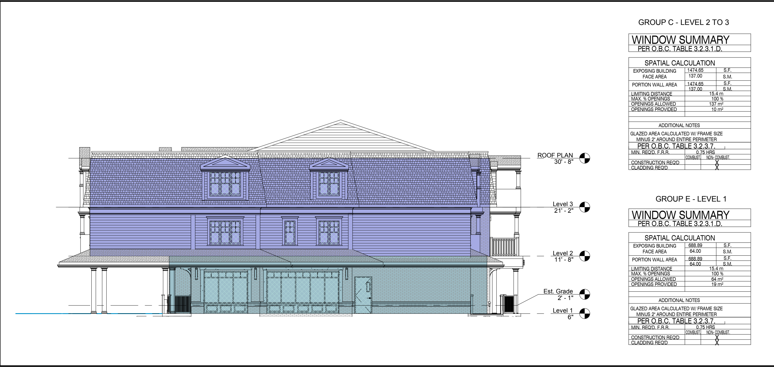
3 EAST ELEVATION 3/32" = 1'-0"