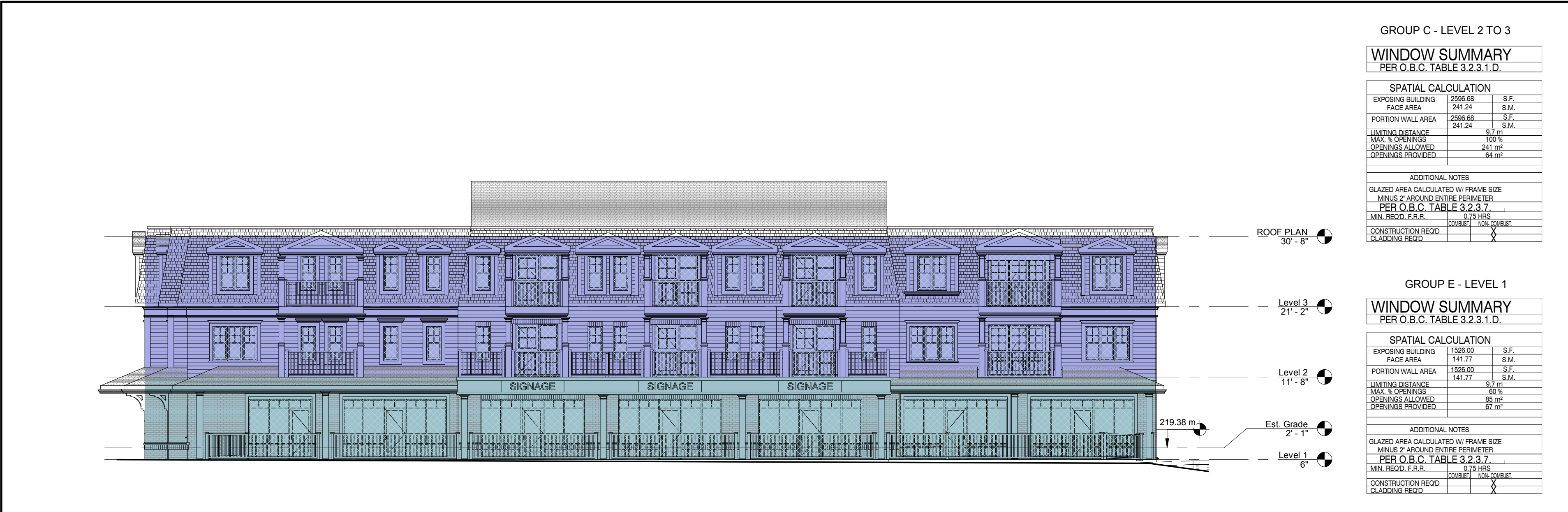
1 NORTH ELEVATION 3/32" = 1'-0"