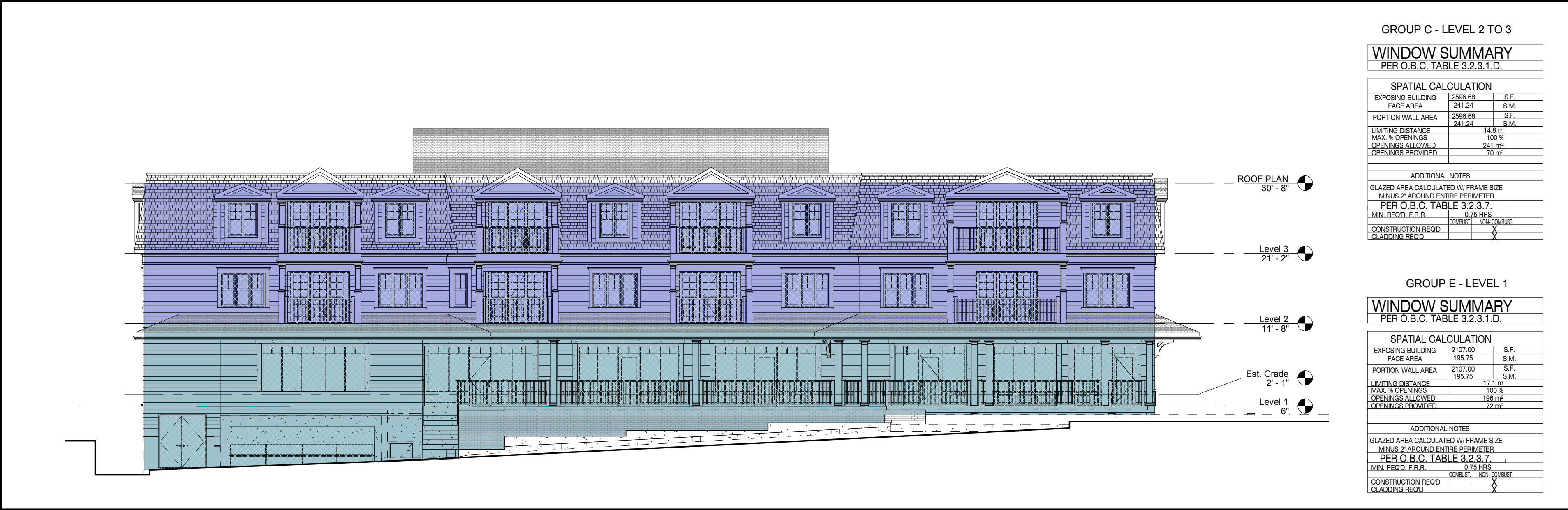
2 SOUTH ELEVATION 3/32" = 1'-0"