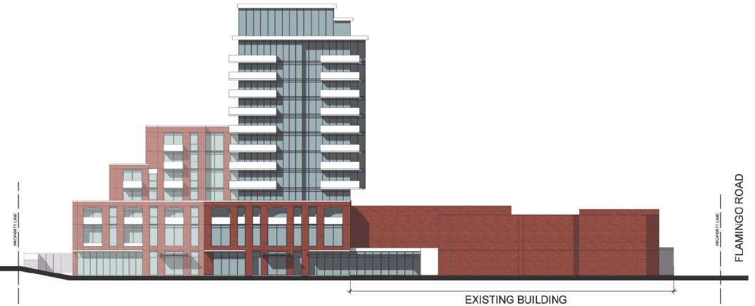
EAST ELEVATION (FACING HIGHCLIFFE DRIVE)