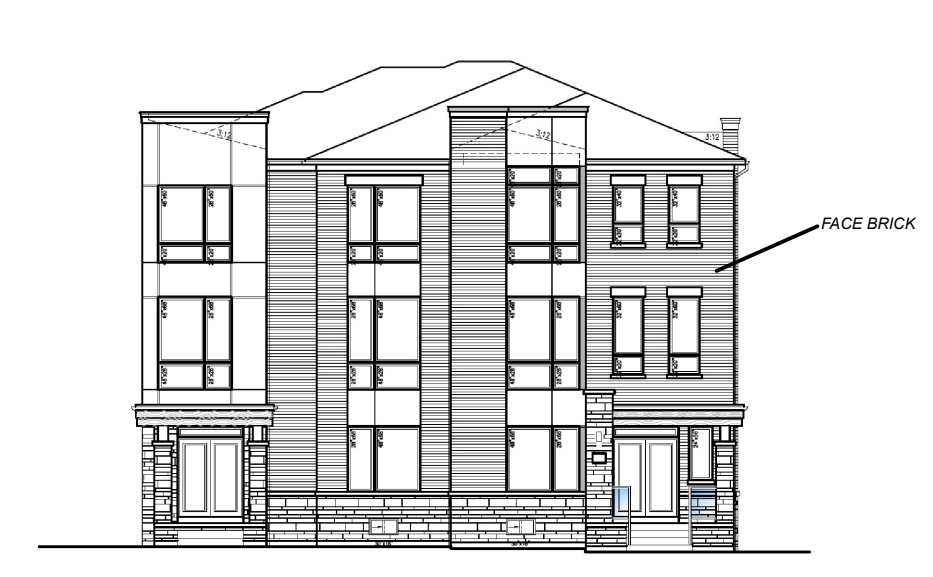
EAST (FRONT) ELEVATION - FACING BATHURST STREET