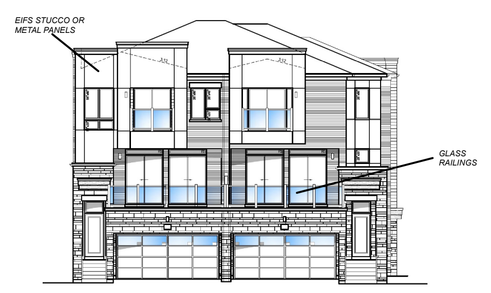
WEST (REAR) ELEVATION - FACING INTERIOR ROAD