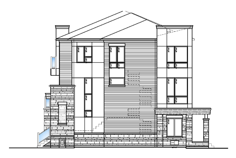
SOUTH (SIDE) ELEVATION - FACING INTERIOR ROAD