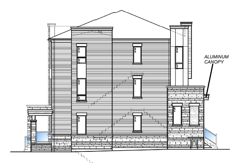
NORTH (SIDE) ELEVATION