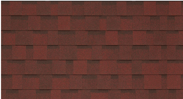
PROPOSED RED ASPHALT SHINGLES