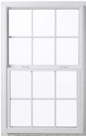
PROPOSED PELLA DOUBLE HUNG WOOD CLAD WINDOW