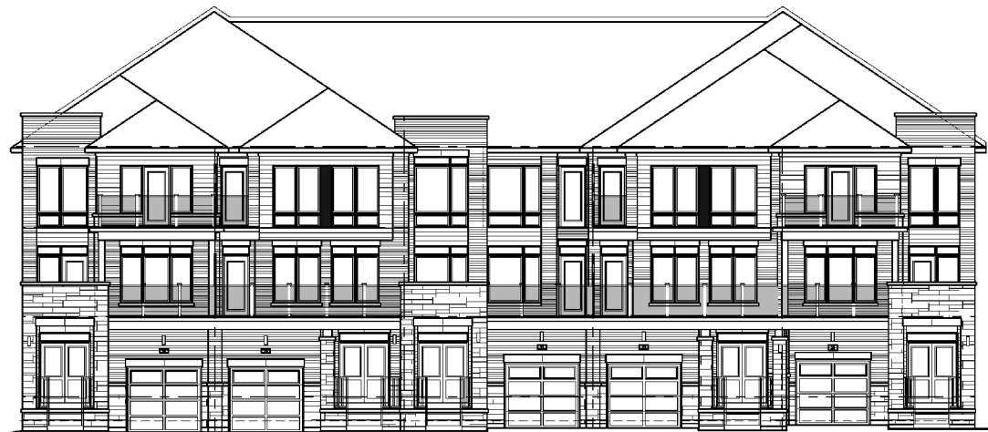
REAR (NORTH) ELEVATION (Facing Private Road)