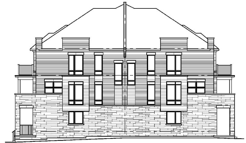
LEFT (WEST) ELEVATION