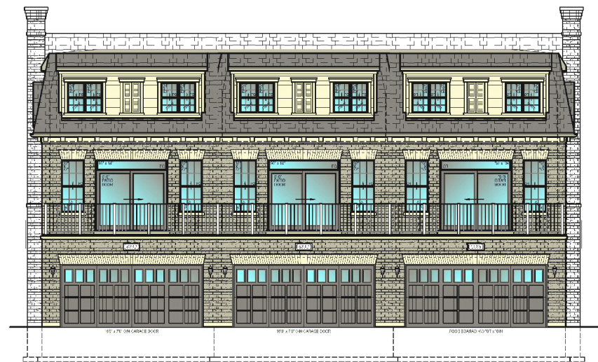
WEST (REAR) ELEVATION