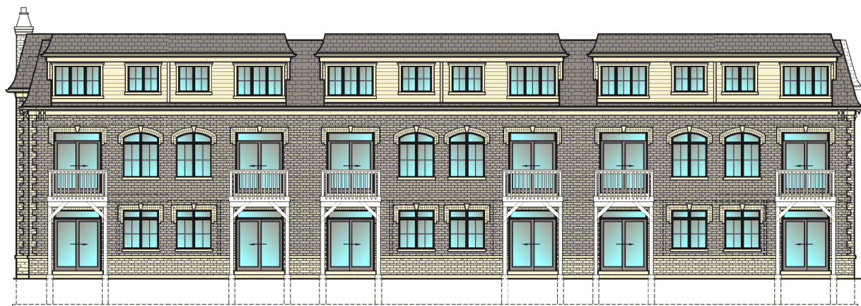
NORTH (REAR) ELEVATION