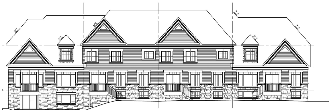
EAST ELEVATION (REAR)