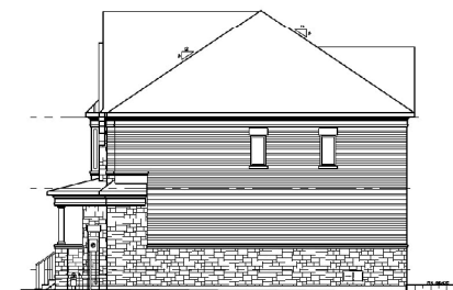
NORTH ELEVATION (RIGHT)