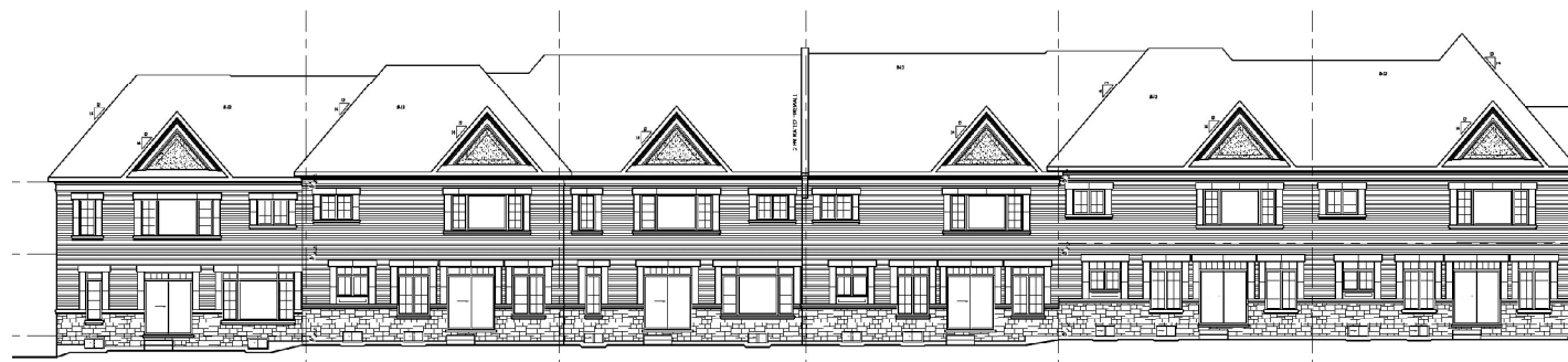
WEST ELEVATION (REAR)