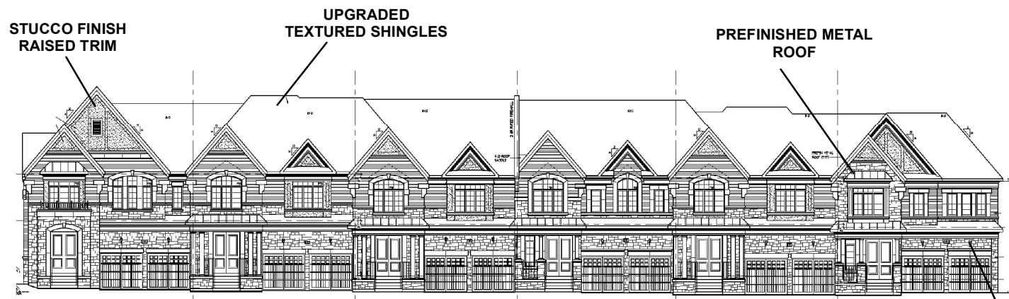
EAST ELEVATION (FRONT) (FACING BATTERSEA DRIVE)