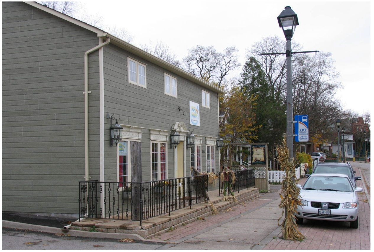
STREET PERSPECTIVE – current conditions