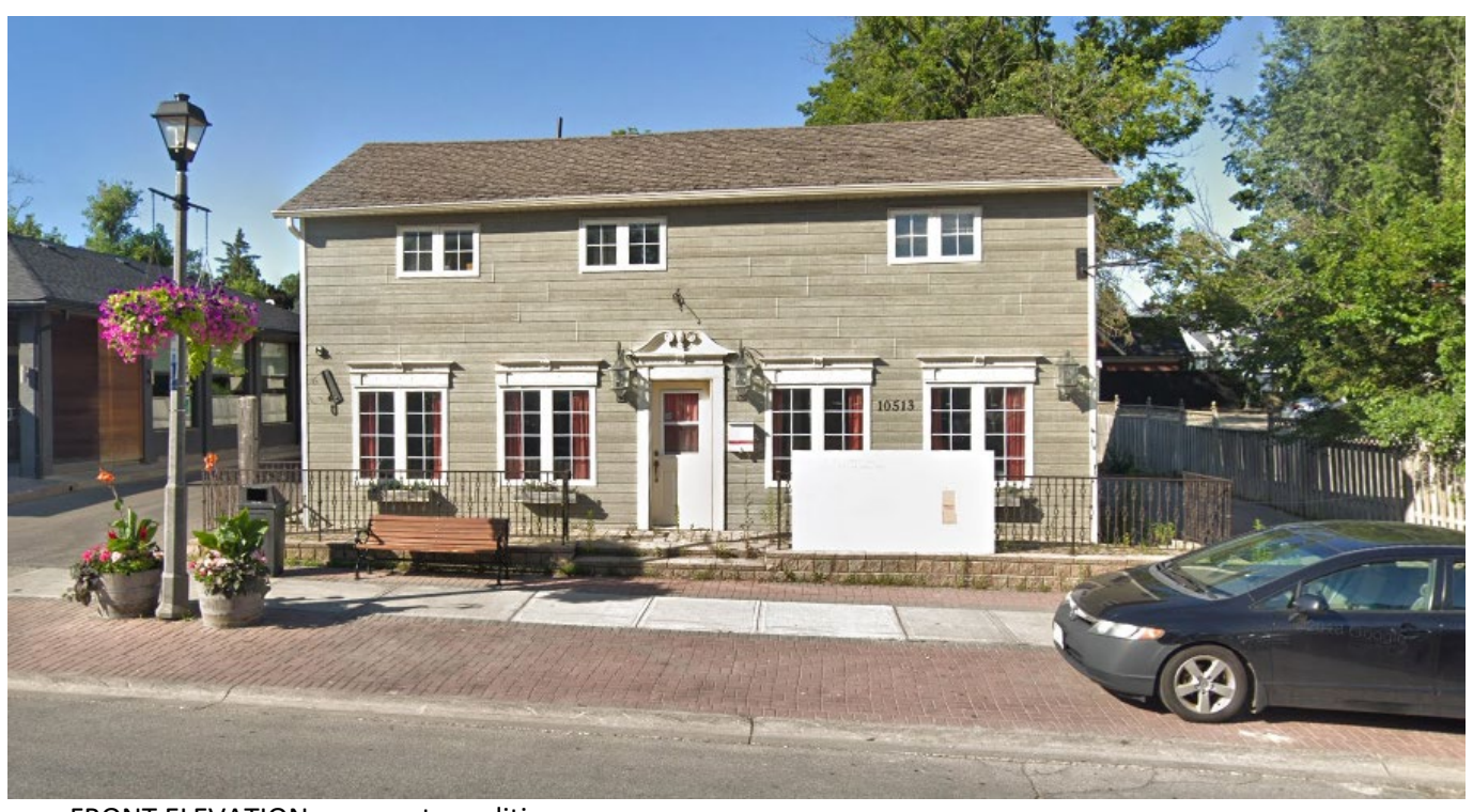
FRONT ELEVATION – current conditions