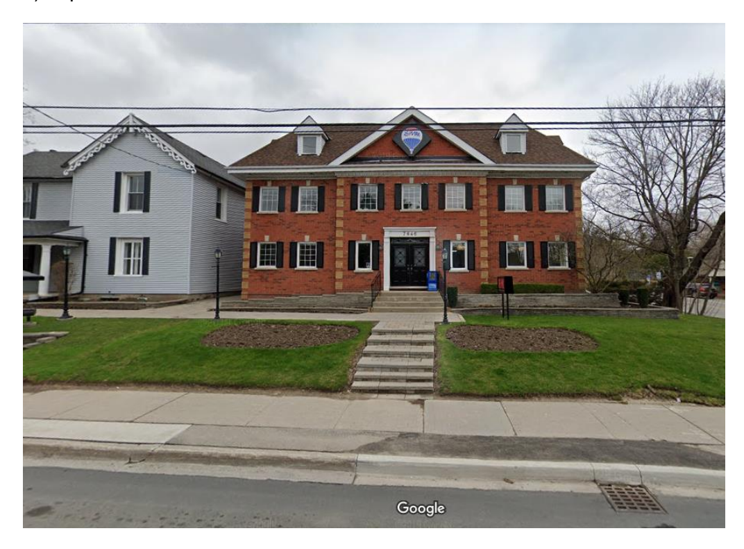
b) August 2019