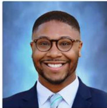
WARD 3 COMMISSIONER Marshall Kilgore Current term expires December 31, 2028.