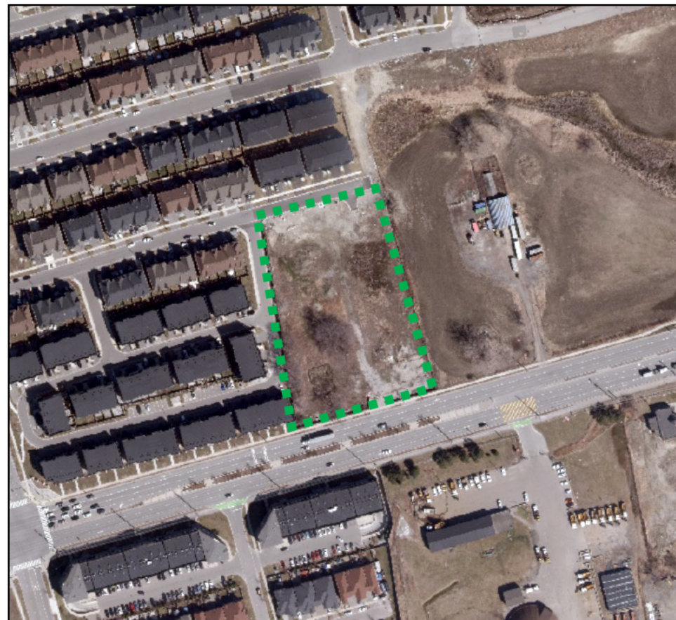
■ ■ ■ ■ ■ Subject Lands