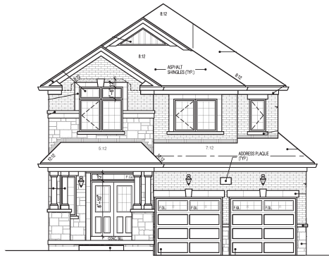
FRONT ELEV.-2 FULTON 1 - 2105