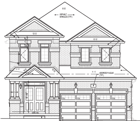
FRONT ELEV.-1 FULTON 2 - 2210