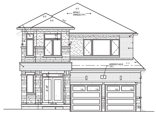
FRONT ELEV.-3 FULTON 3 - 2293

Typical 11.6m Single Detached Dwelling Elevation