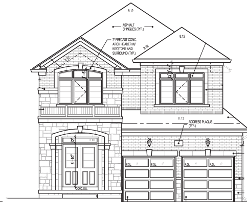
FRONT ELEV.-2 FULTON 2 - 2210