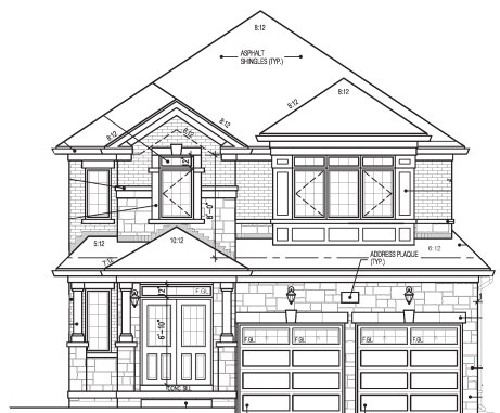
FRONT ELEV.-2 FULTON 3 - 2293 (2304 sq.ft.)