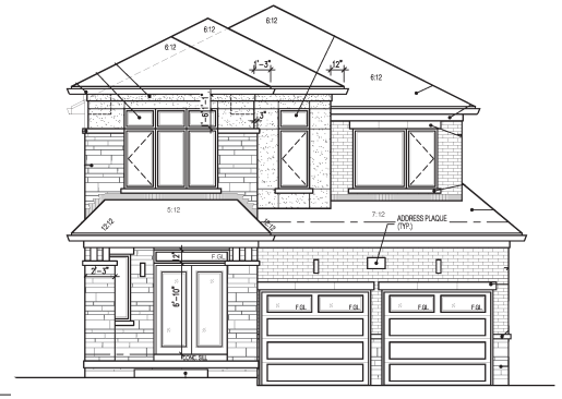
FRONT ELEV.-3 FULTON 1 - 2105 (2114 sq.ft.)