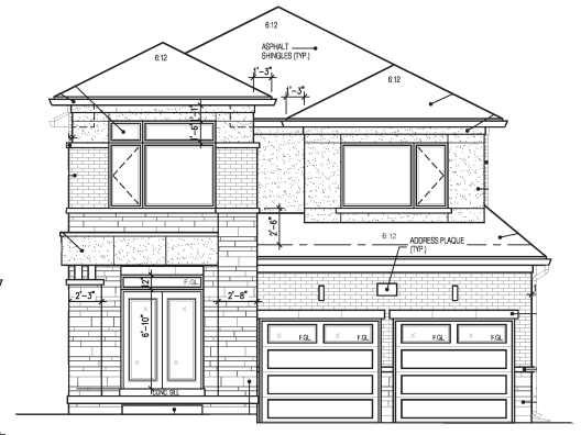
FRONT ELEV.-3 FULTON 2 - 2210 (2204 sq.ft.)