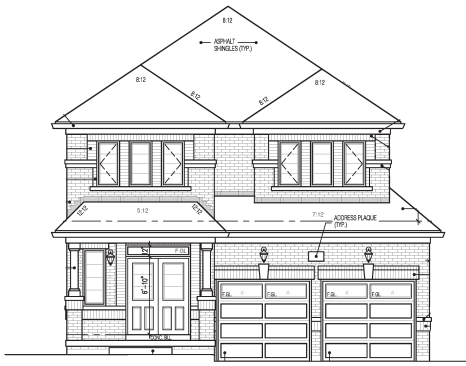
FRONT ELEV.-1 FULTON 1 - 2105