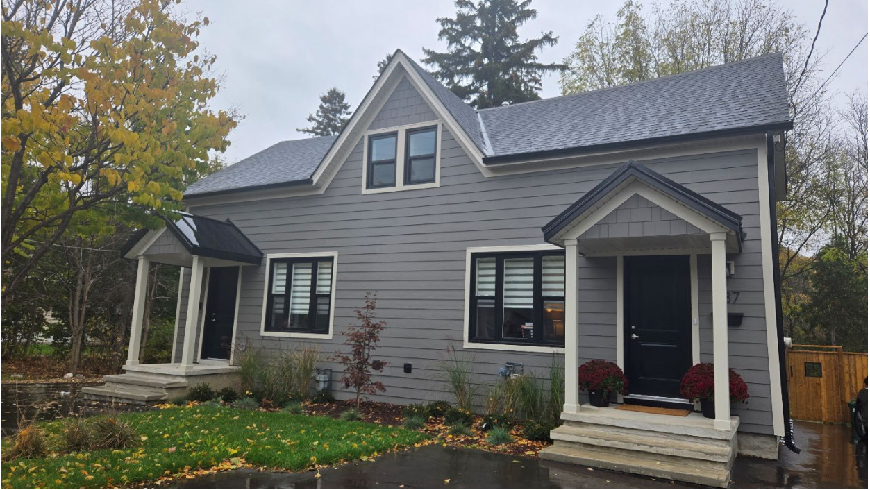
137 and 141 Clarence St - October 30, 2025