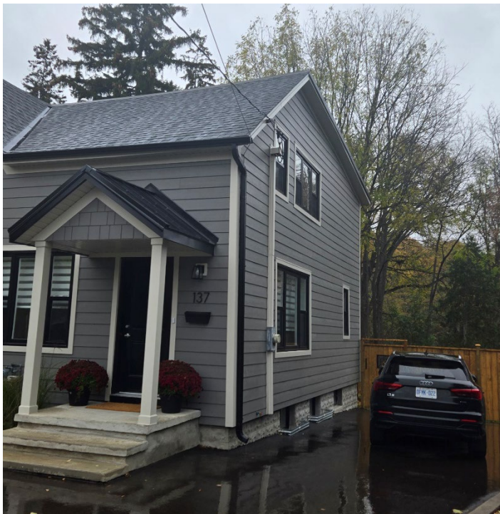
2025 Grant Submission