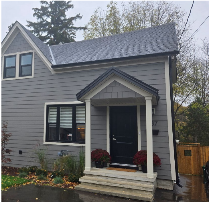
2025 Grant Submission