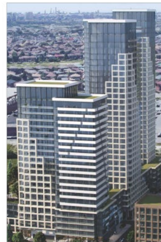
2 A014 BUILDING C TOWERS

From: Christopher Cosentino < Christopher.Cosentino@vaughan.ca >