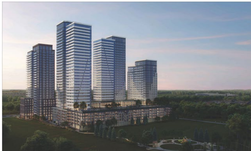
1 A013 VIEW NORTHWEST