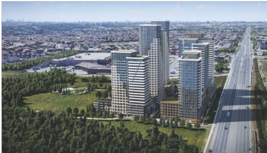
1 A011 VIEW SOUTHEAST